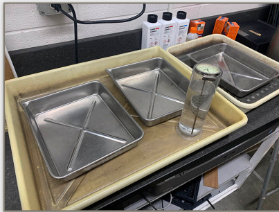
Trays used for processing

Although tanks are typically used for the developing process, I used trays to submerge the papers and films in the appropriate solutions in a specific order and for specific times according to temperature. The entire process had to take place in complete darkness. (Yes, the room had to be inspected for light leaks also!)