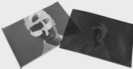
At left, a 5x7 film processed into a negative. At right, a 5x7 sheet of printing paper used to check for light leaks in the camera.