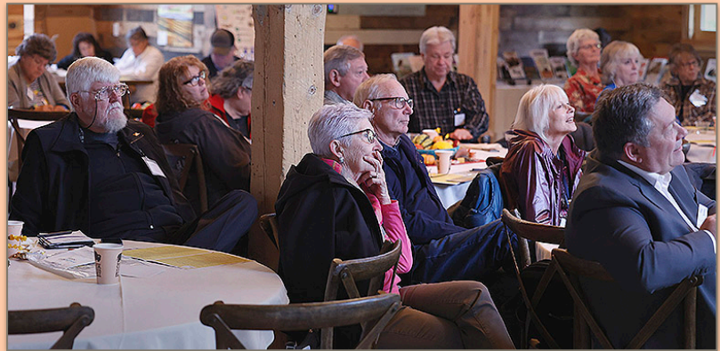
Above: Attendees at the West River History Conference.

The 30th West River History Conference was held Oct. 5-8, 2022. The event was held at the event barn and State Game Lodge at Custer State Park. Chautauqua style performances closed out the conference at the convention center in Keystone. (More on pg. 2)