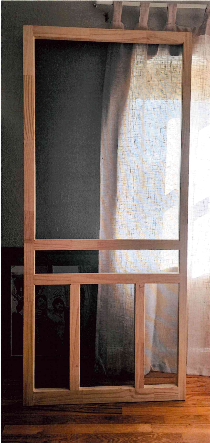
Wooden Screen door