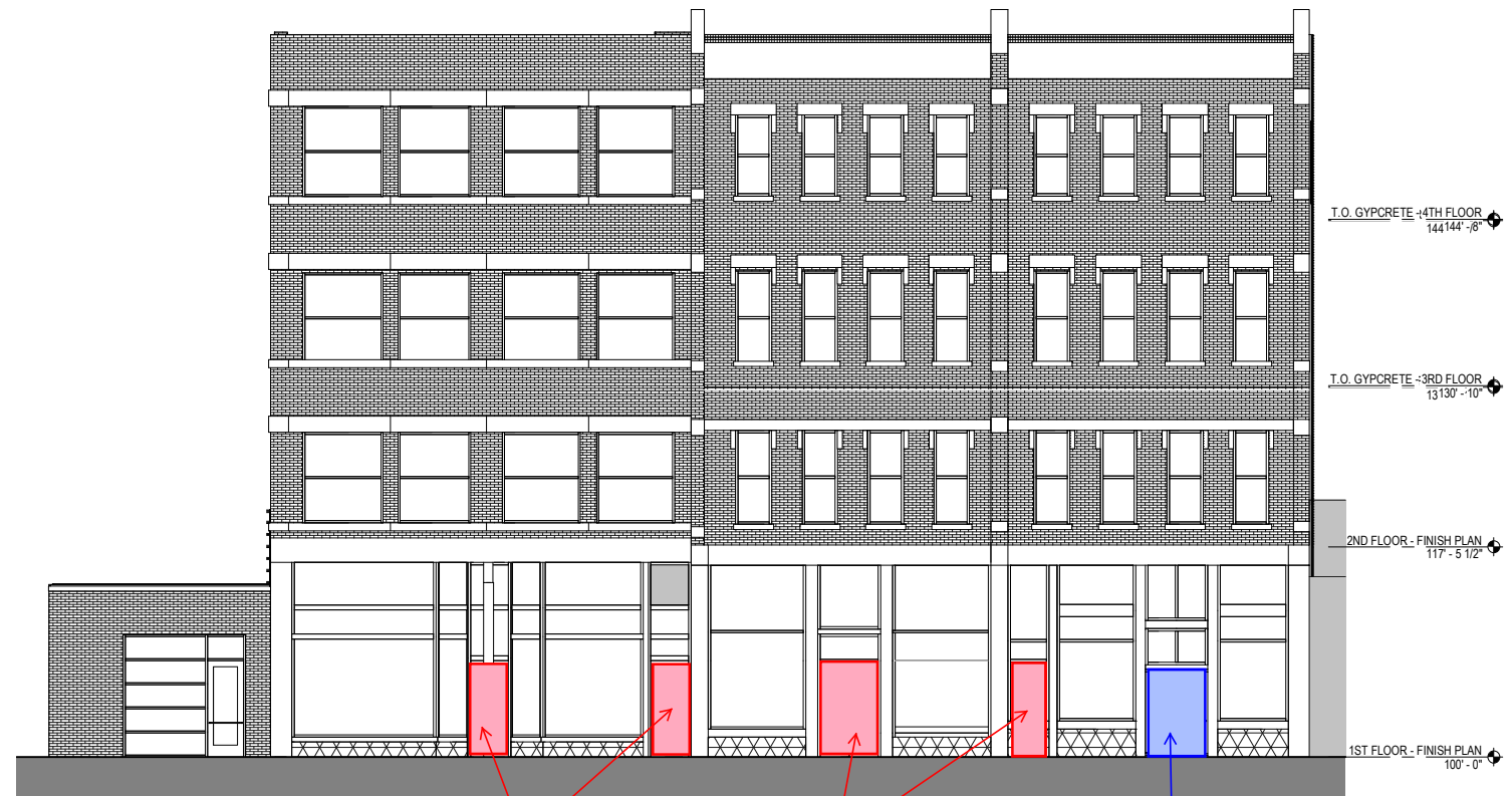
1 WEST EXTERIOR ELEVATION A201 1/8" = 1'-0"

RECONSTRUCT WOOD DOORS TO MATCH ORIGINAL DOORS.