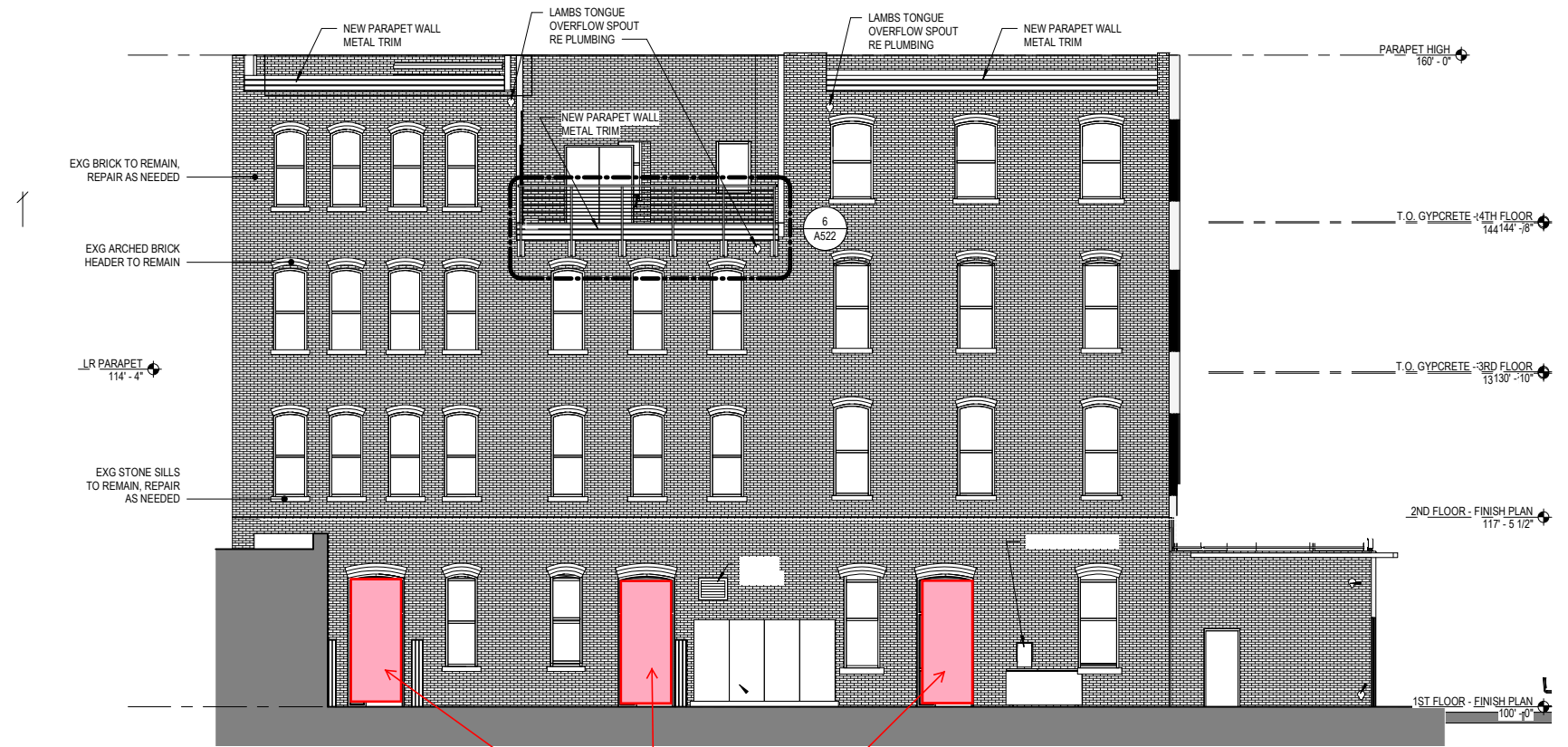
3 EAST EXTERIOR ELEVATION A201 1/8" = 1'-0"

RECONSTRUCT WOOD DOORS TO MATCH ORIGINAL DOORS.