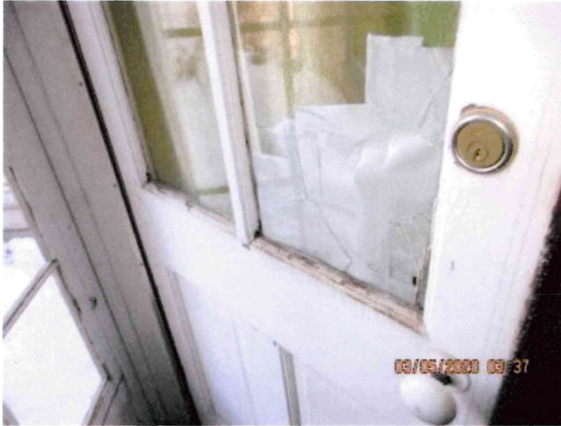
Master Bedroom Door