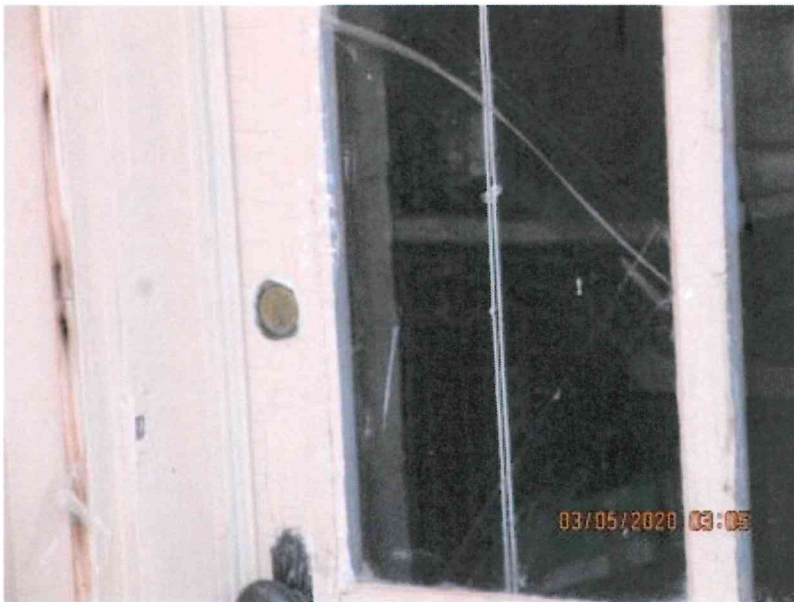
Kitchen door – broken