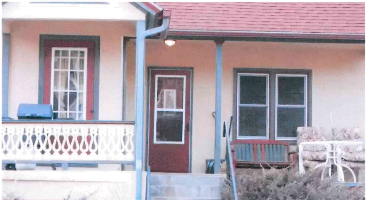
Outside view – Main door/secondary door and vinyl windows