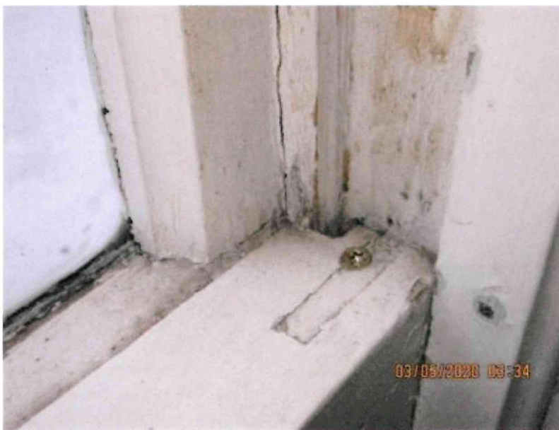
Bedroom Windows – Broken and screwed shut