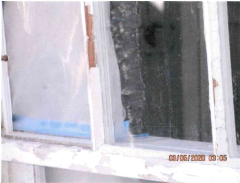
Outside Kitchen Window