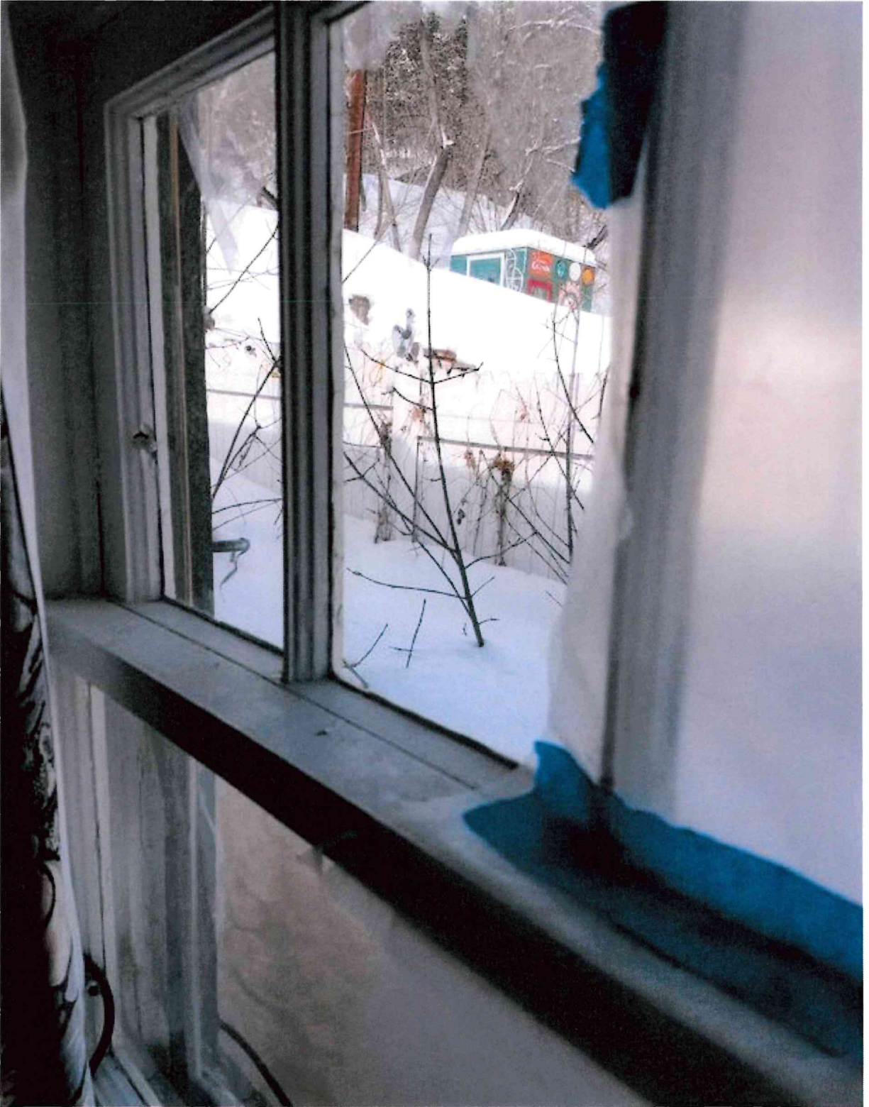
Inside Kitchen Windows – Broken and painted shut