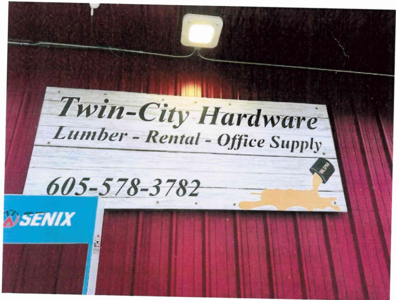
Existing sign located to the right of the main entrance