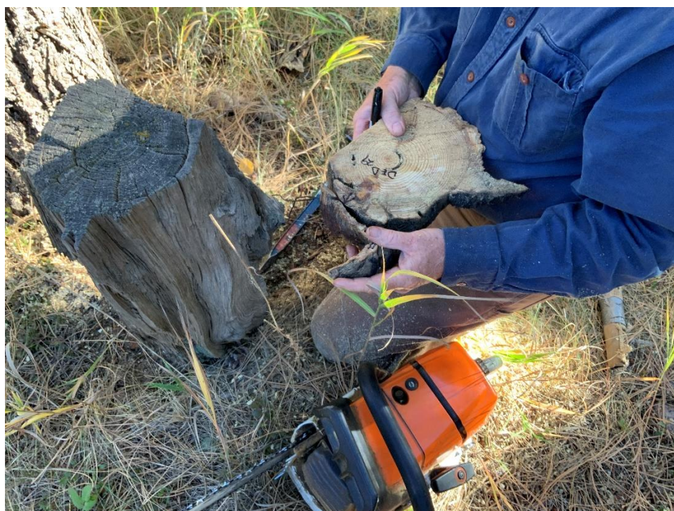
Image #02 Close up of weathered stump and wood "cookie" with fire scars.