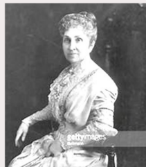
Great Homestake Gold Mine, miners pictured above, circa 1888. Top right: George Hearst Bottom right: Phoebe Apperson Hearst