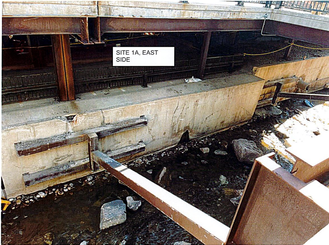
NOTE: AREA JUST UPSTREAM FROM PHOTO ON PAGE 3.