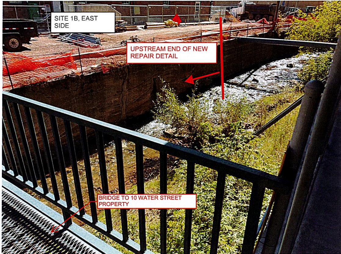
NOTE: PHOTO TAKEN FROM 10 WATER STREET PROPERTY, LOOKING EAST.