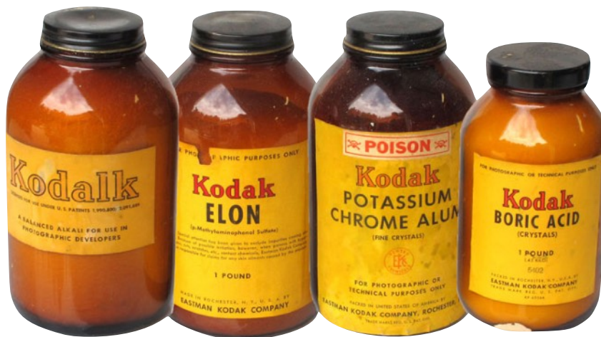
Above: A variety of chemicals used in the photographic process.

Watch for an opportunity to participate in a “Day in the Darkroom” at Spearfish High School in February by visiting blackhillshistory.org and clicking on “EDUCATION”.