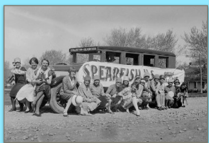
Undated Spearfish High School Girls Glee Club