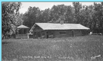
Undated image of Pine Crest Tourist Park in Spearfish.