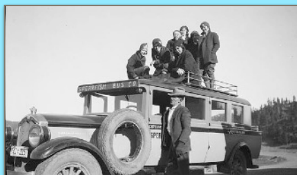
Undated image Spearfish Bus Co.