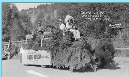
1928 Days of 76 Parade float