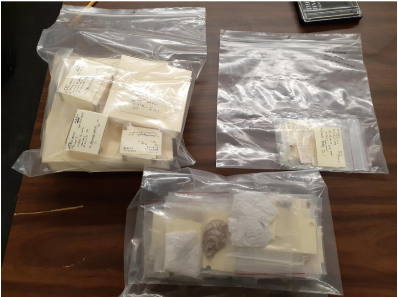
Image #01 overview of freshwater and saltwater mollusks and shells from the 2001 to 2004 Chinatown excavation.

Mike Runge Archivist Telephone (605) 578-2082