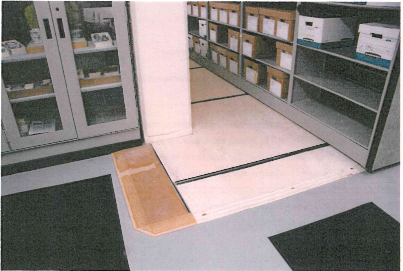
Overview of proposed subflooring in archaeology lab.