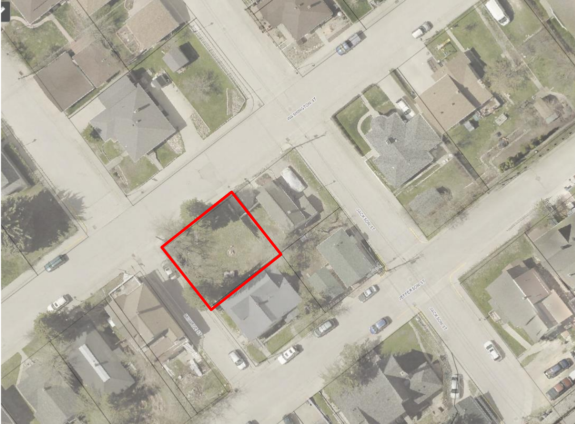
Map showing the general vicinity of the subject property.