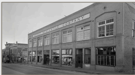
Undated image of Hearst Mercantile in Lead.