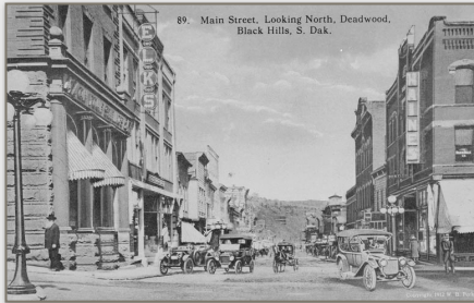
Postcard of Deadwood 1912.