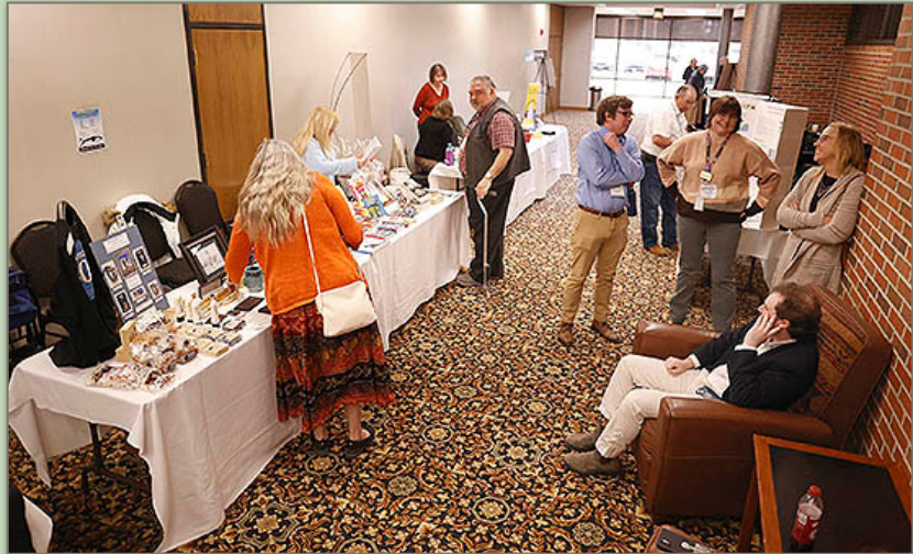
Above: Attendees visit with vendors during a break.