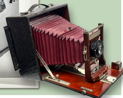
Below: Conley Folding Bed Revolving Back Camera for 5x7 plates circa 1907.