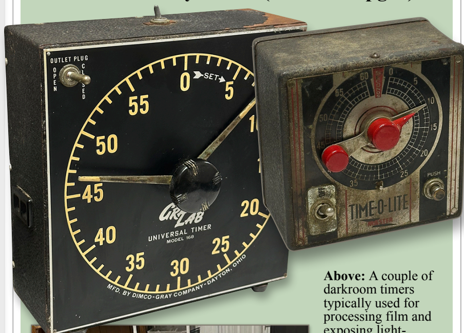
Above: A couple of darkroom timers typically used for processing film and exposing light-sensitive papers for printing. The Gralab Model 168 darkroom timer, left, is a model from the 1950s. The Time-O-Lite M-49, right, was produced in the 1940s.