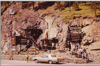
Broken Boot Gold Mine

Various promotional images from Deadwood circa 1970.