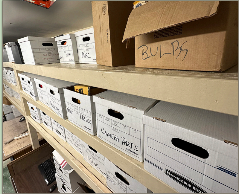
Above: Boxes from cold storage in Deadwood relocated to Lead city hall.