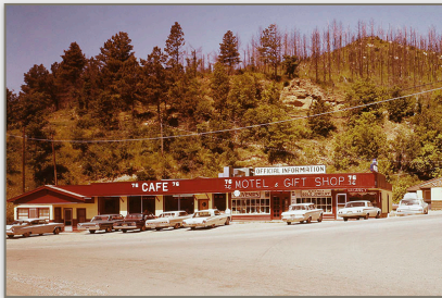
76 Cafe Motel and Gift Shop