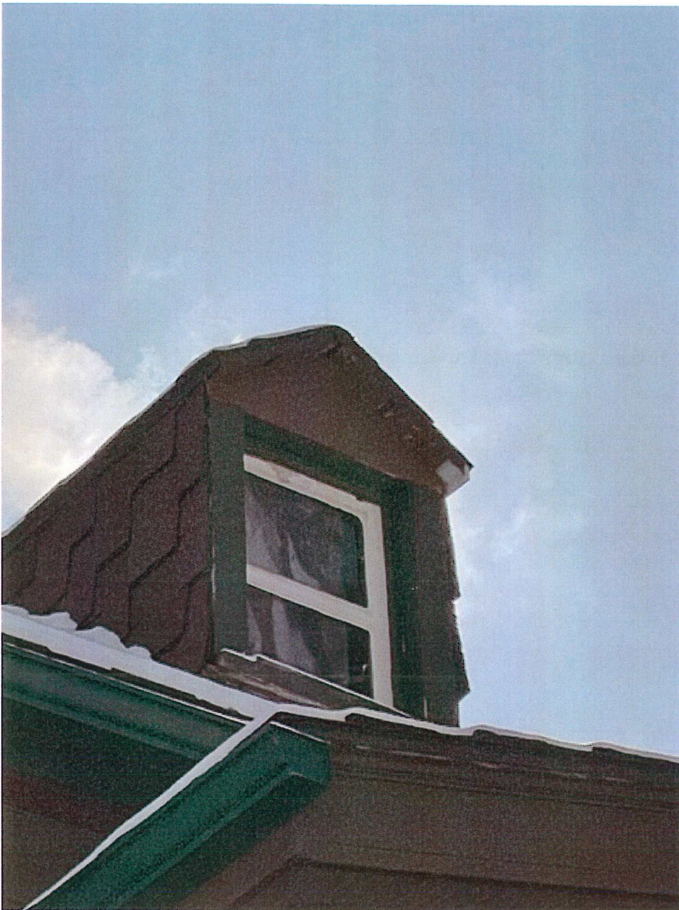
South facade, 4 windows