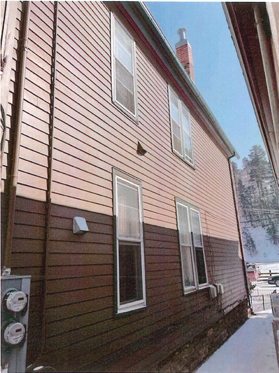
Main floor interior south side window