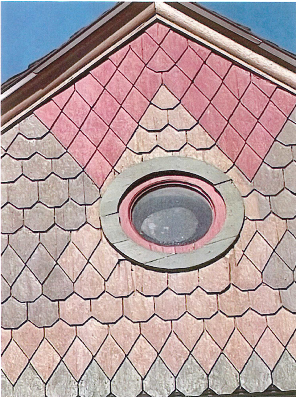
North side, 4 widows