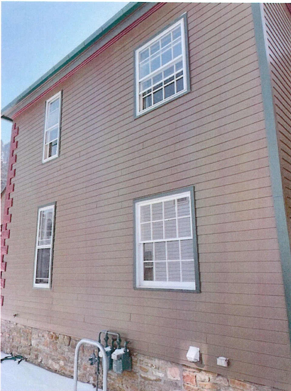
West side, 4 windows