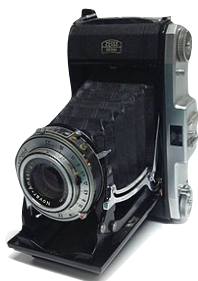
Exhibit at Days of '76

An exhibit featuring both photography and equipment from the Fassbender Photographic Collection is now on display at the Days of '76 Museum in Deadwood. Most of the photographs have been stored at the Homestake Adams Research & Cultural Center and Lead City Hall. However, most of the rest of the artifacts have been in cold storage. The new exhibit will finally give visitors a look at some of those previously stored darkroom, studio and camera items.