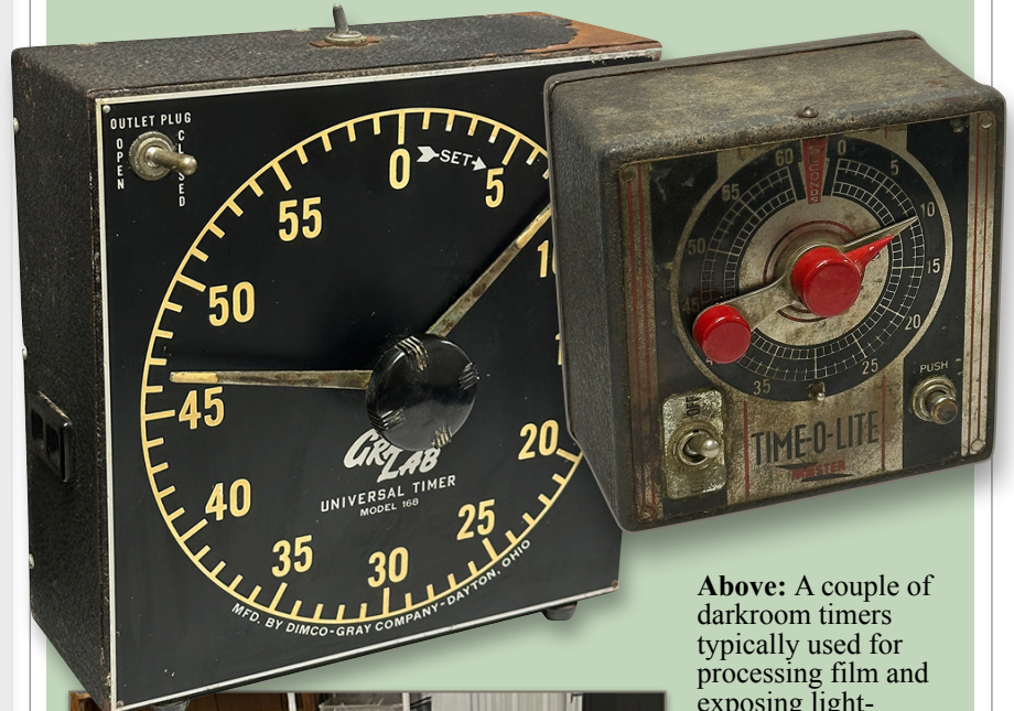
Above: A couple of darkroom timers typically used for processing film and exposing light-sensitive papers for printing. The Gralab Model 168 darkroom timer, left, is a model from the 1950s. The Time-O-Lite M-49, right, was produced in the 1940s.