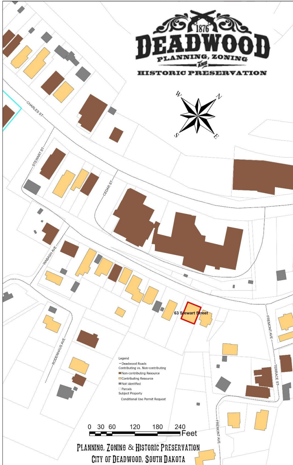
Map showing the general vicinity of the subject property.