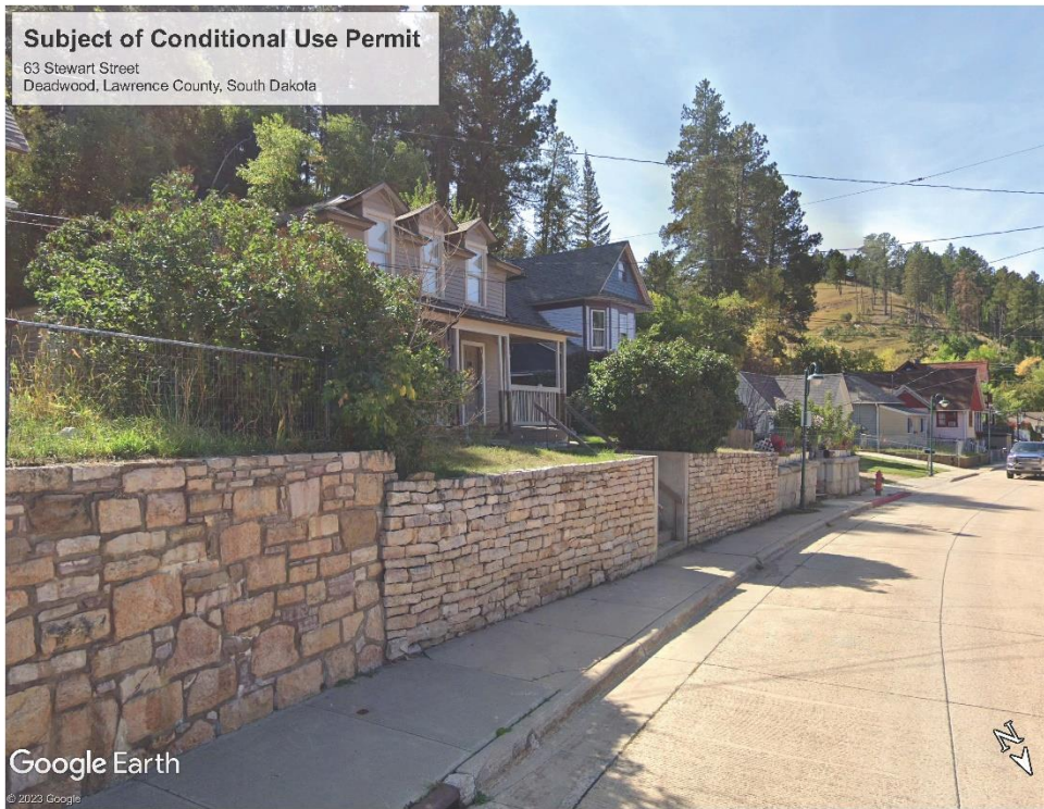
Street view of subject property