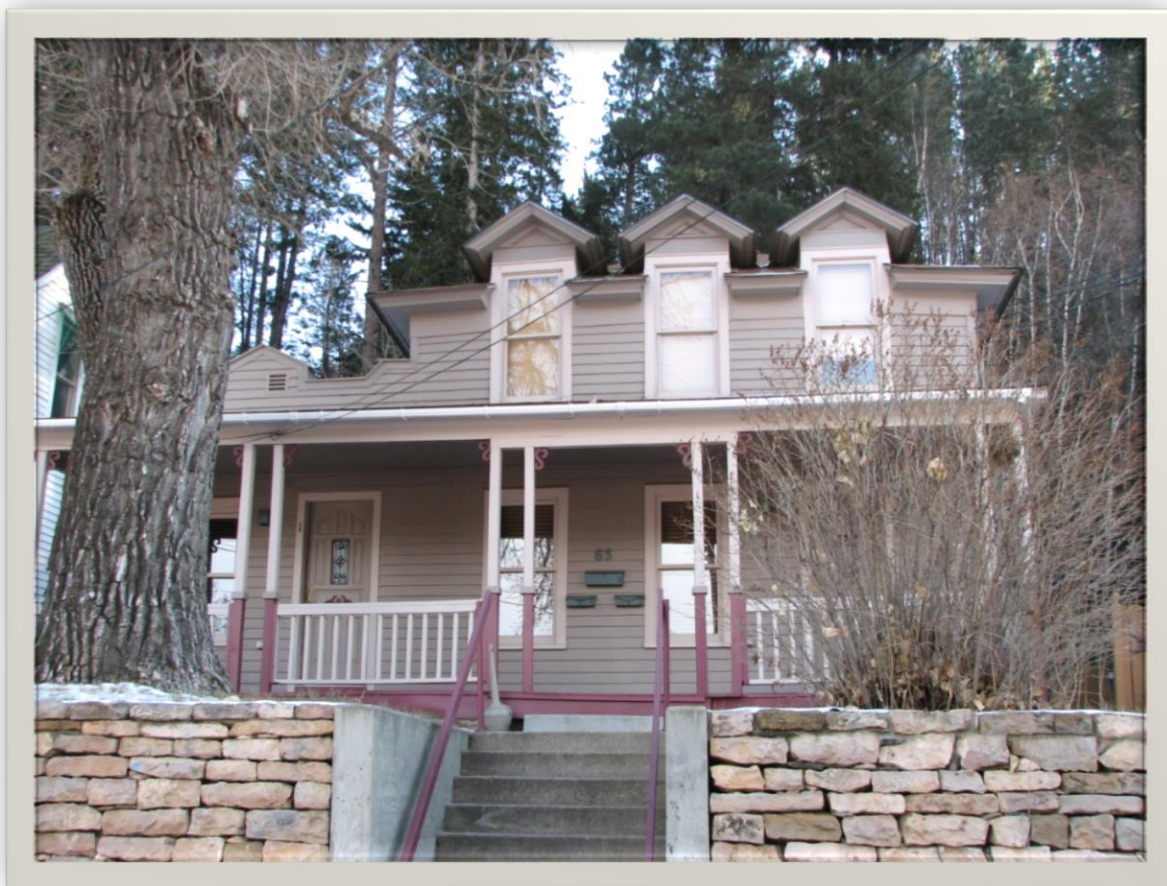
2008 photo of subject property