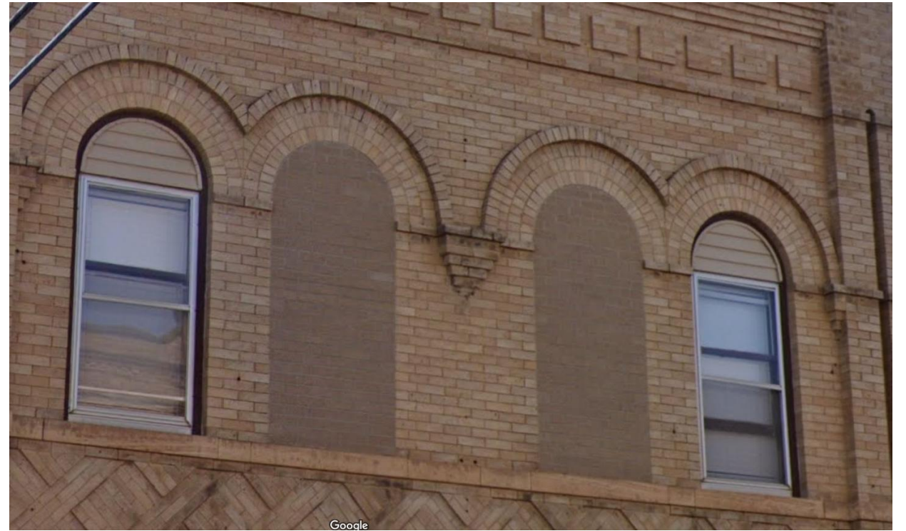
Front (east) Façade views showing ornamental brick detail, August 2024, Google Maps view.

McDonald Block Building, 25 1 st Avenue West Dickinson, ND