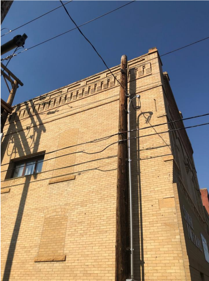
From South, staff photo, 10/9/2024