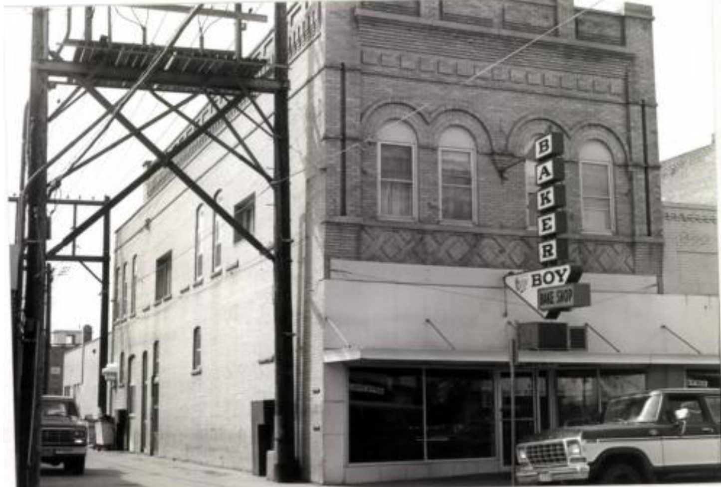
McDonald Block Building, 1983