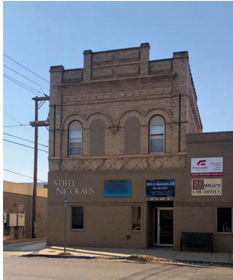
From East, staff photo, 10/9/2024