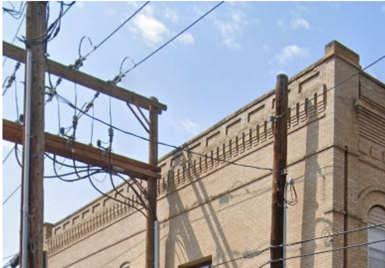
Alley (south) Façade view of ornamental brick detail, August 2024, Google Maps view.

McDonald Block Building, 25 1 st Avenue West Dickinson, ND