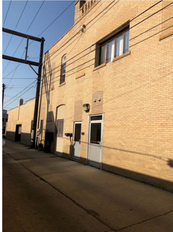
From ESE, staff photo, 10/9/2024