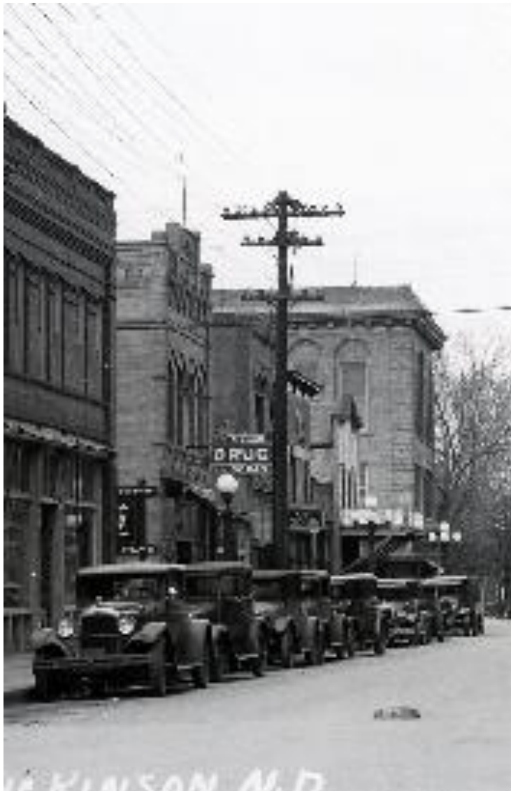
Undated distant view of McDonald Block, west side of Barnes Street (1 st Avenue East).