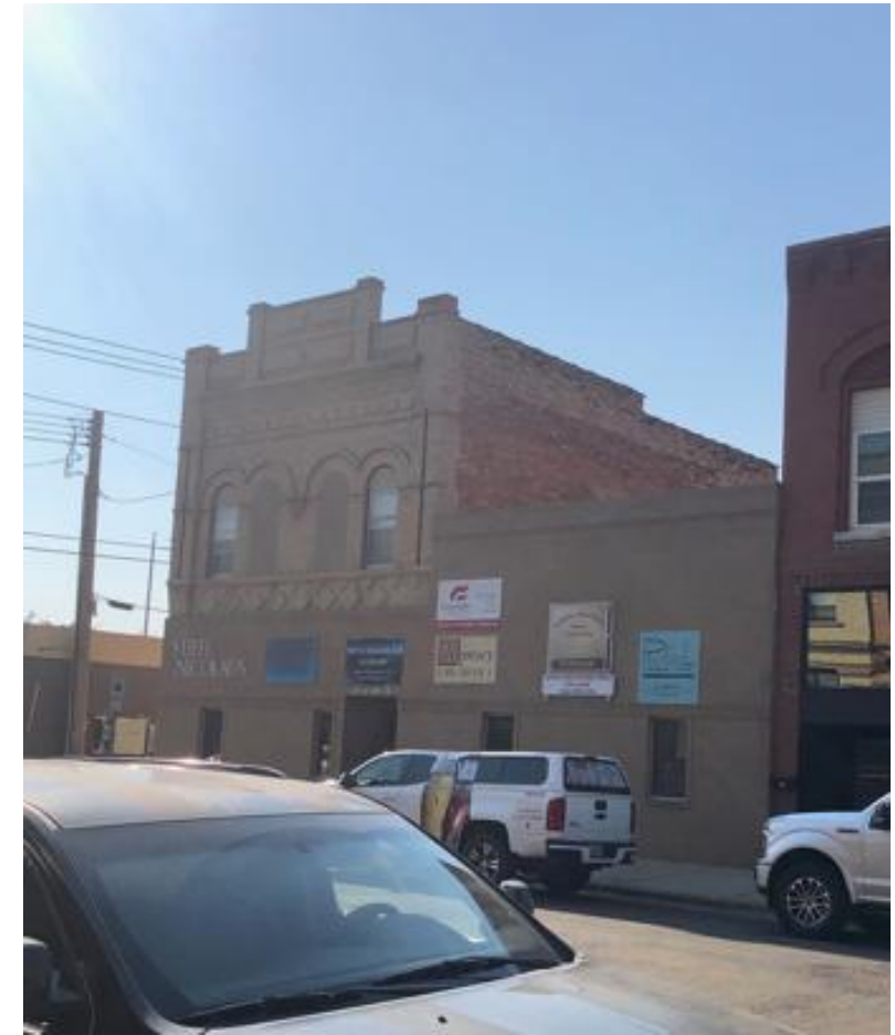
From ENE, staff photo, 10/9/2024

McDonald Block Building, 25 1 st Avenue West Dickinson, ND