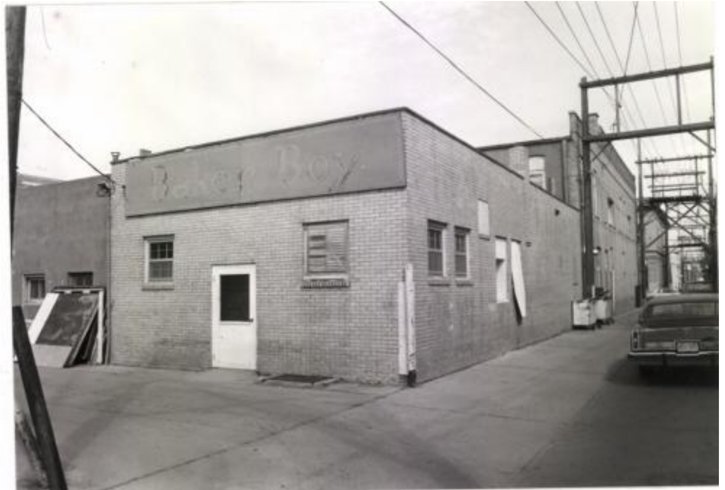
McDonald Block Building, 1983, view from west showing later addition, c.1927-63(?) Note Baker Boy signage