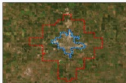
Web Map Dickinson Street Information Map Map Showing various street designations for the City of Dickinson,ND