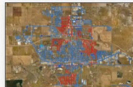
Web Map Dickinson Utility Information Map Utility locate layers for the City of Dickinson, ND