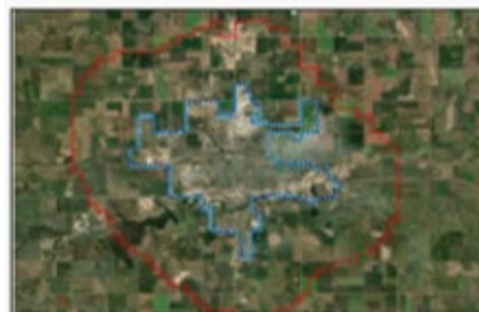
Web Map Dickinson Land Information Map Information about Tax parcels, Zoning, and other features.