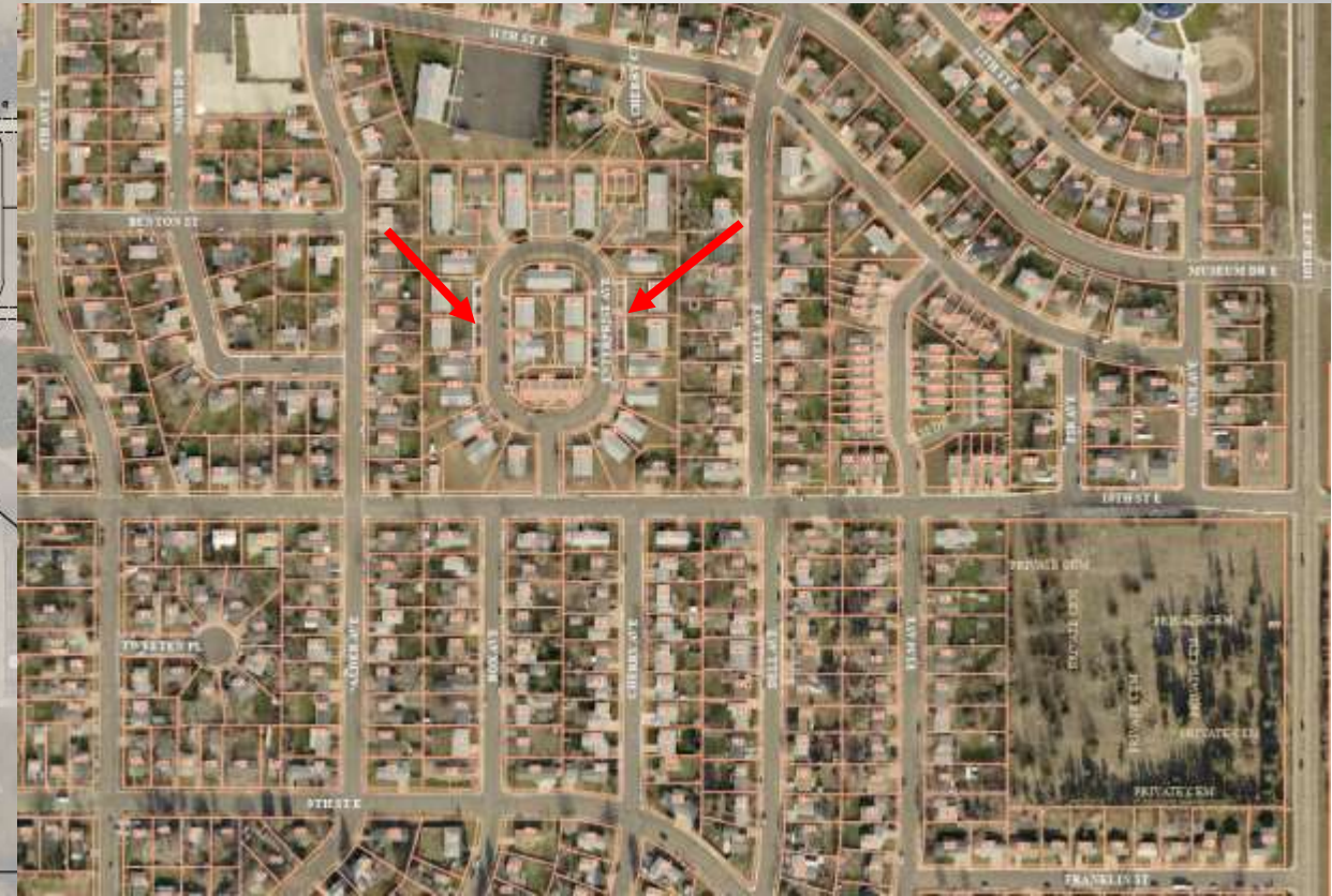
202601: 2026 ROAD MAINTENANCE - MILL & OVERLAY