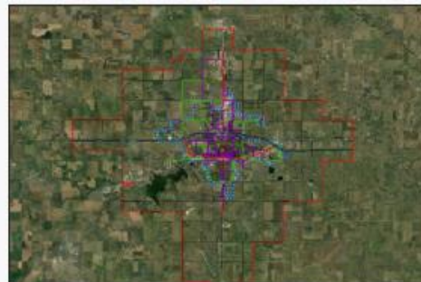
Web map Dickinson Street Information Map Map Showing various street designations for the City of Dickinson, ND