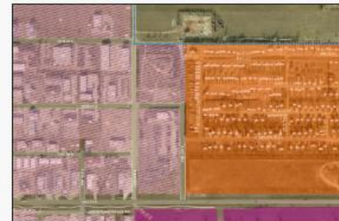
Web map Dickinson Zoning Information ... Information about Zoning, and other features.