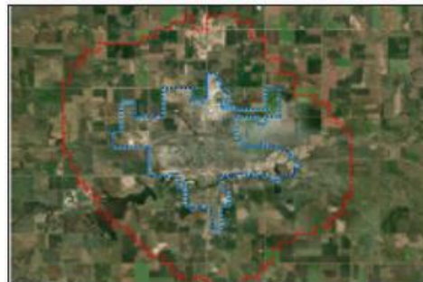
Web map Dickinson Land Information Map Information about Tax parcels, Zoning, and other features.