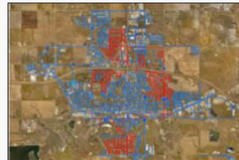
Web map Dickinson Utility Information Map Utility locate layers for the City of Dickinson, ND