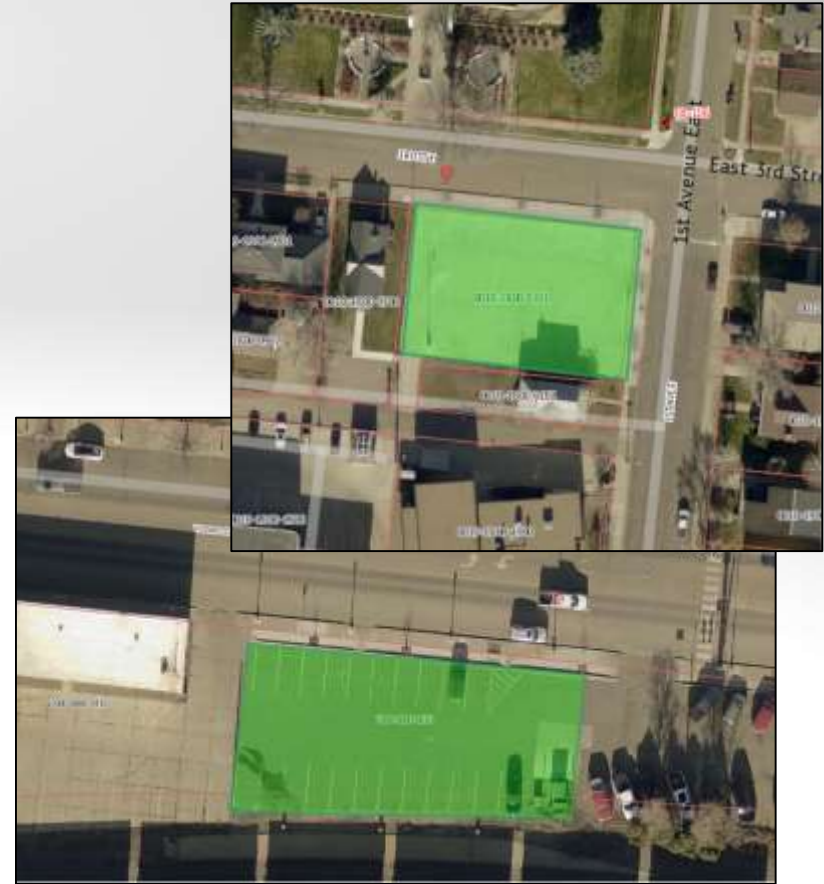
Additional Approved Areas