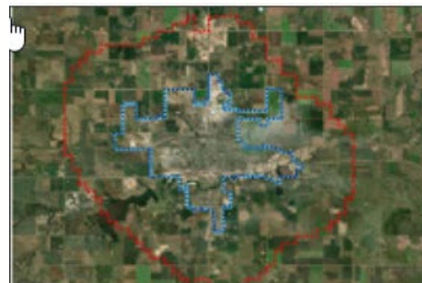
Web map Dickinson Land Information Map Information about Tax parcels, Zoning, and other features.