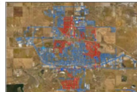
Web map Dickinson Utility Information Map Utility locate layers for the City of Dickinson, ND