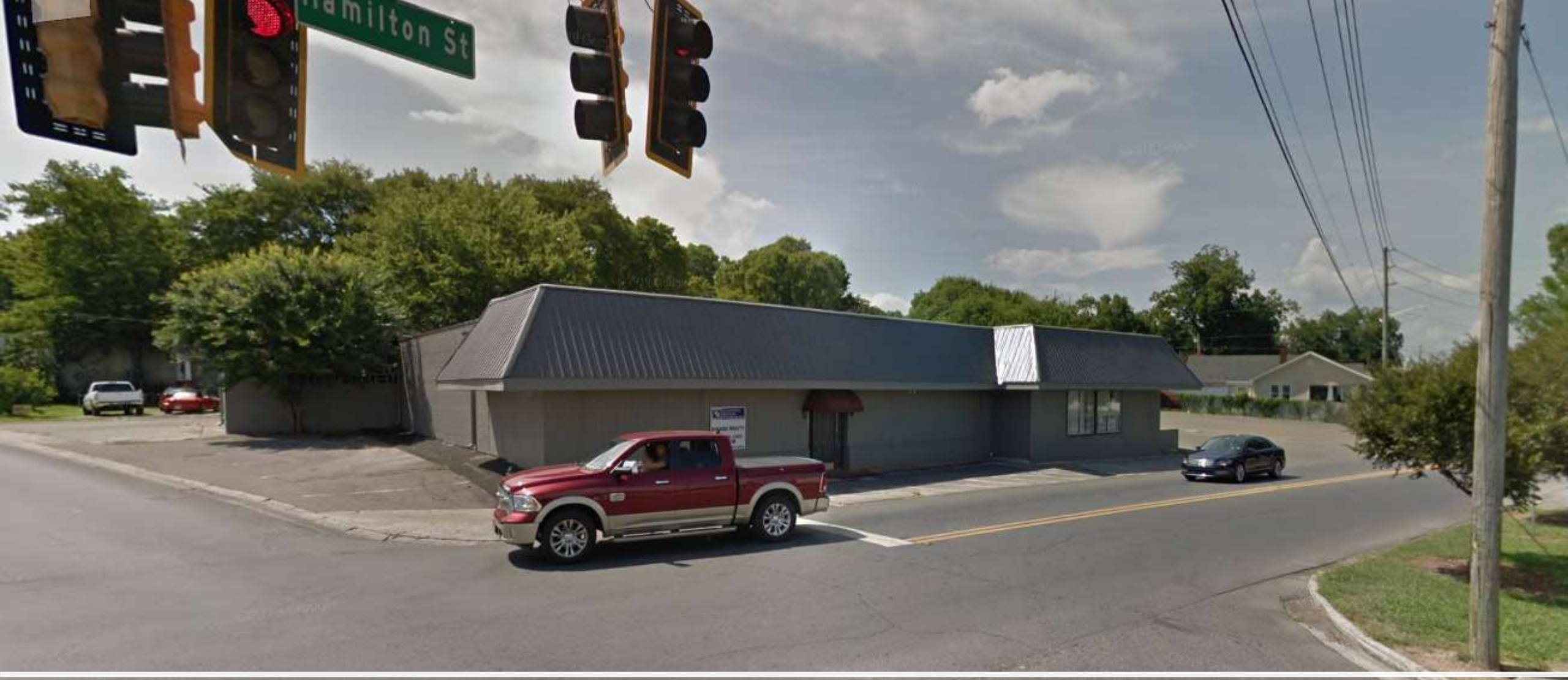
ECM Rezoning C-2 to R-7 View facing northwest along N. Hamilton St.