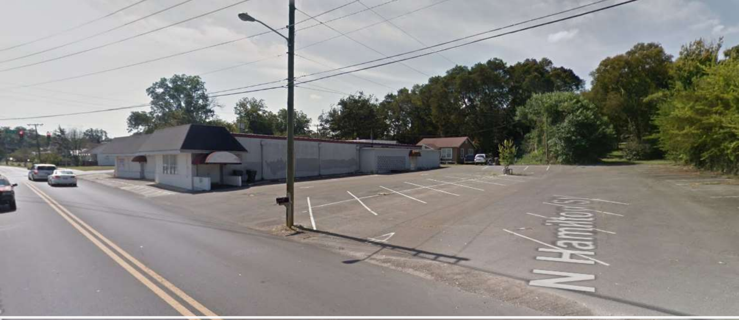
ECM Rezoning C-2 to R-7 View facing southwest along N. Hamilton St.