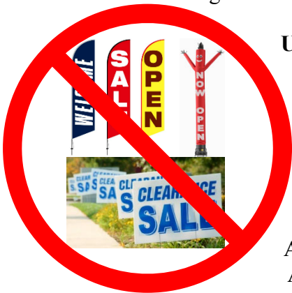
Figure 3: Examples of prohibited signs within the Gateway Corridor Overlay District