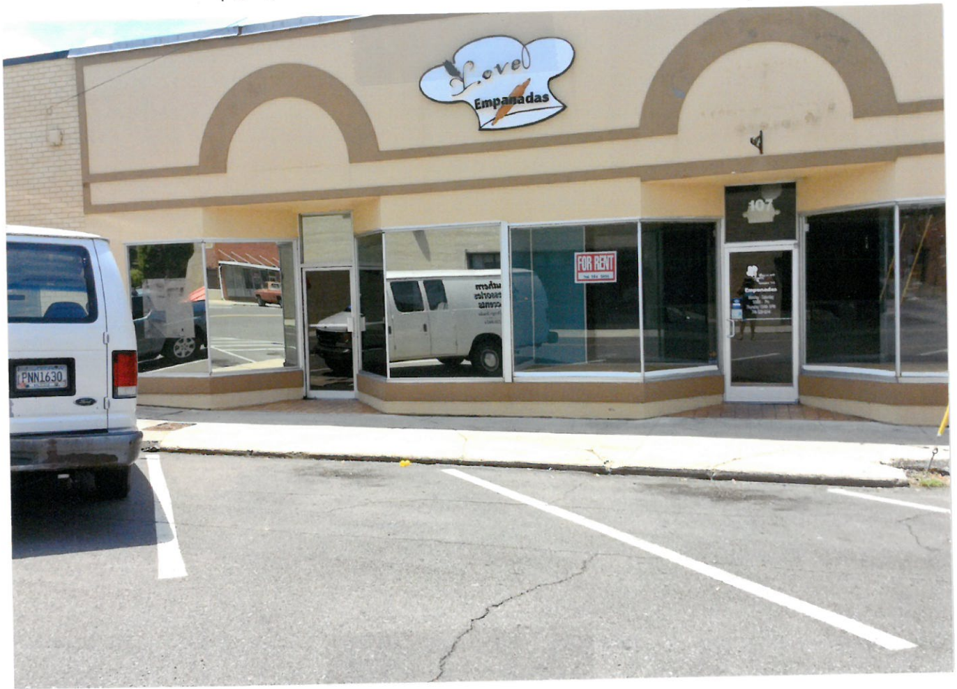
Current facade at 105 + 107 Cuyler Street