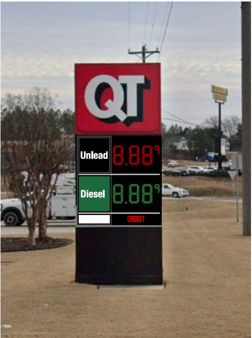
Proposed Monument Sign (NOT EXACT) Proposed Sq Ft: 53.1