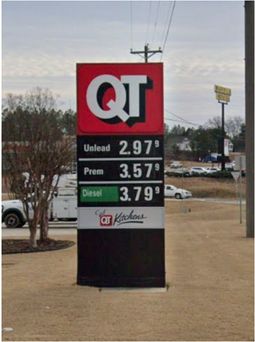
Existing Monument Sign Existing Sq Ft: 53.1