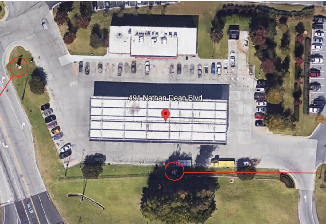
Existing monument sign