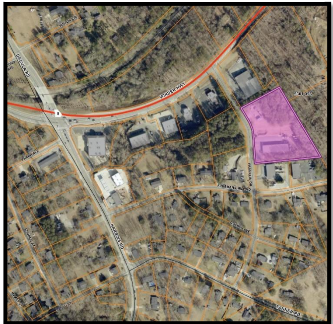
Figure 1 Aerial

General information about the project is provided below. The application documents are available following the staff report.