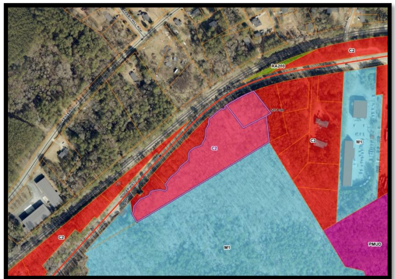
Figure 2 Surrounding Zoning

The subject site is east of the Winder Highway and Stanley Road intersection, and approximately half a mile from the Winder Highway and SR 316 intersection. Across Highway 29 to the north is CSX rail right-of-way. Abutting the parcel to the northwest is an undeveloped parcel zoned C-2 containing a stream that runs into the subject site. To the south and west is the University Logistics development, which contains three (3) speculative warehouses that are under construction, zoned M-1 (Light Manufacturing).