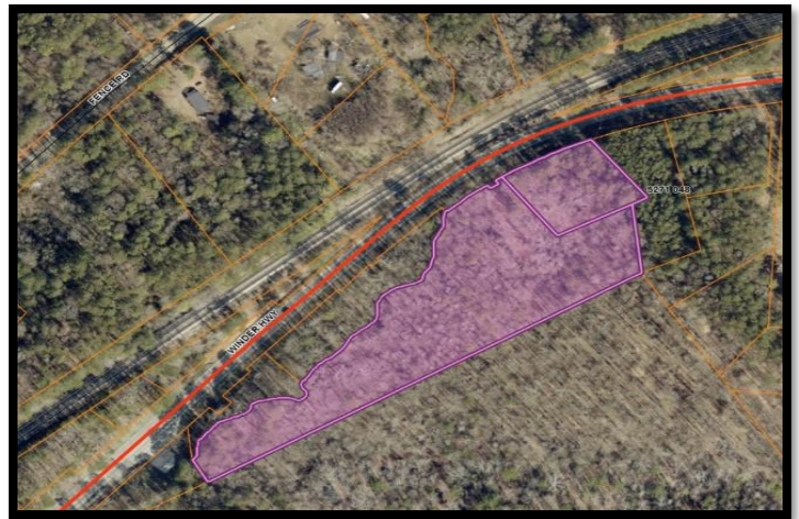
Figure 1 Aerial

General information about the project is provided below. The application documents are available following the staff report.