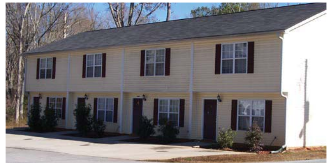
Figure 26