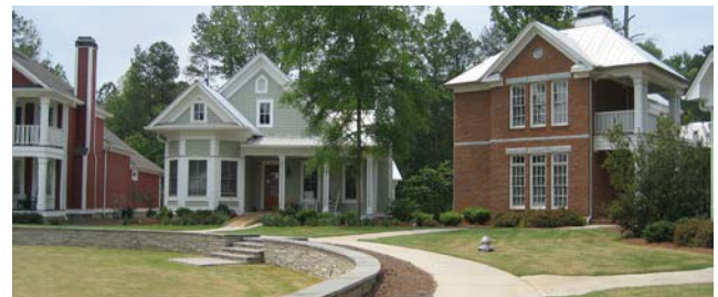
Figure 25

The Dacula Downtown character area is primarily for commercial retail, office, and residential land uses. Zoning change and redevelopment requests should be consistent with a downtown character, including provision of entertainment, locally driven cultural and other community gathering uses. Effort should be made to add connectivity in the road network, add sidewalks and multi-use trails. Multi-use trails should logically connect with planned efforts by the County.