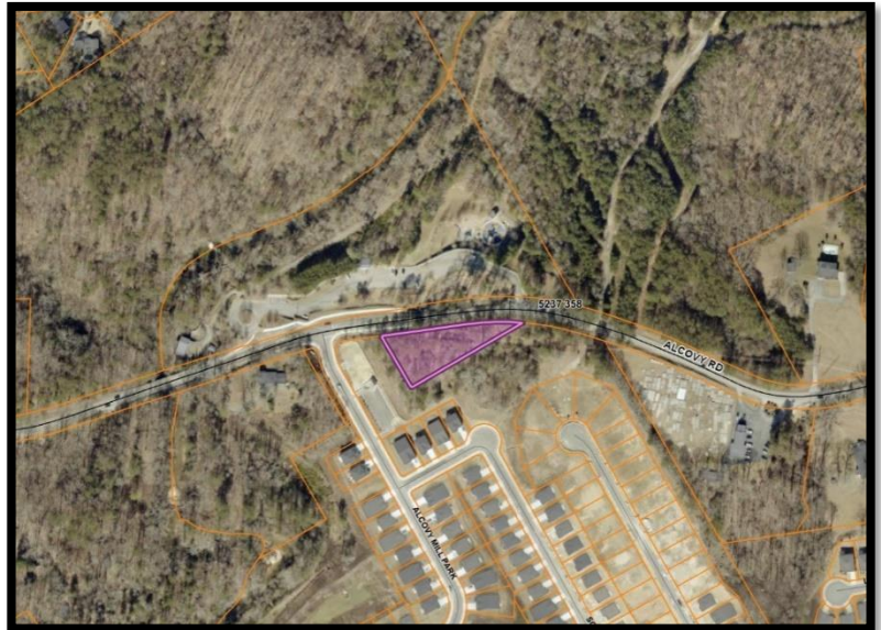
Figure 1 Subject Site Aerial

General information about the project is provided below. The application documents are available following the staff report.