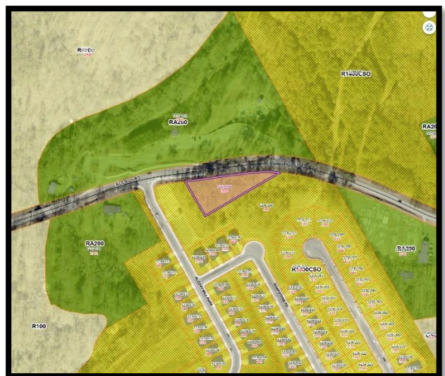
Figure 2 Zoning

The letter of intent contends that due to the requirement of a minimum of twenty (20) acres for Conservation