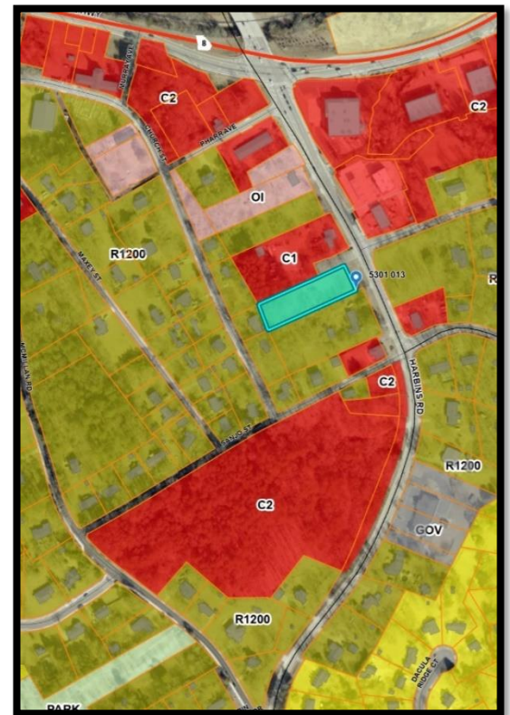
Figure 2 Surrounding Zoning Classifications

The project site is surrounded by a variety of commercial and residential zoning classifications. To the north, the subject parcel is bordered by 341 Harbins Rd, which is zoned as C-1 DOD (Neighborhood Commercial District, Downtown Overlay District ), which contains an active cell tower service company. To the west and south are two active residential parcels zoned R-1200 DOD (Single-Family Residential District, Downtown Overlay District ). Across Harbins Rd in the north-eastern quadrant of the Harbins Rd and Freemans Mill Rd intersection is a legal nonconforming gas station, which is zoned C-1 DOD (Neighborhood Commercial District, Downtown Overlay District ). Across Harbins Rd, in the southwest quadrant of Freemans Mill Rd intersection is a large lot residential home, zoned R-1200 DOD (Single-Family Residential District, Downtown Overlay District ).