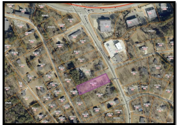
Figure 1 Aerial

General information about the project is provided below. The application documents are available following the staff report.