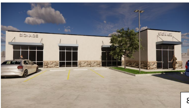
808 Hwy 90 E, Next to El Portal