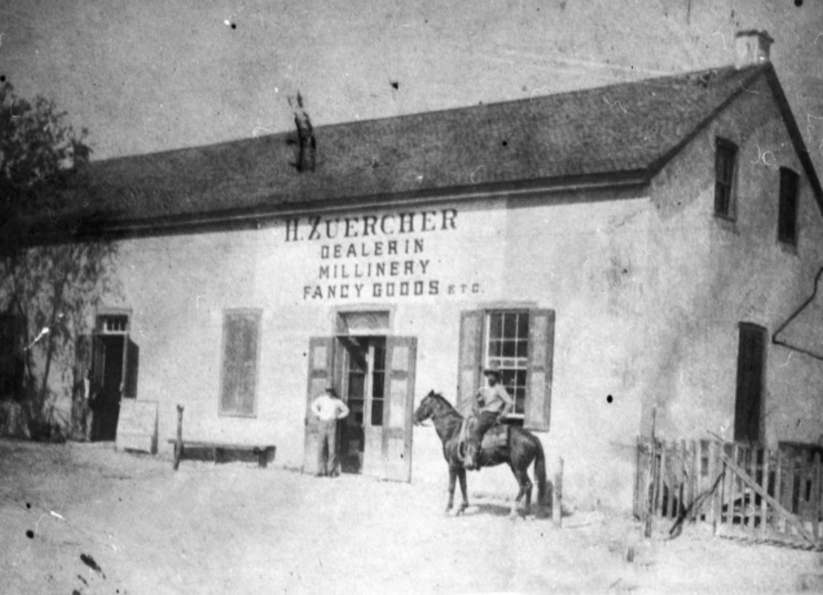
Zuercher Millinery in Klappenbach Building, Madrid Street (Houston Square),