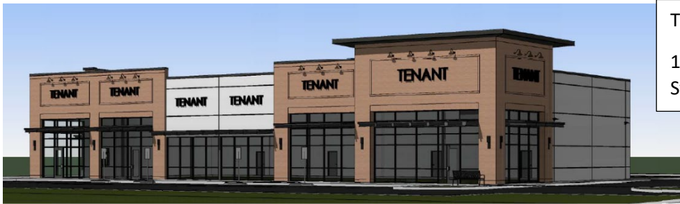
Town East Crossing

1726 Hwy 90 E, Next to Security State Bank