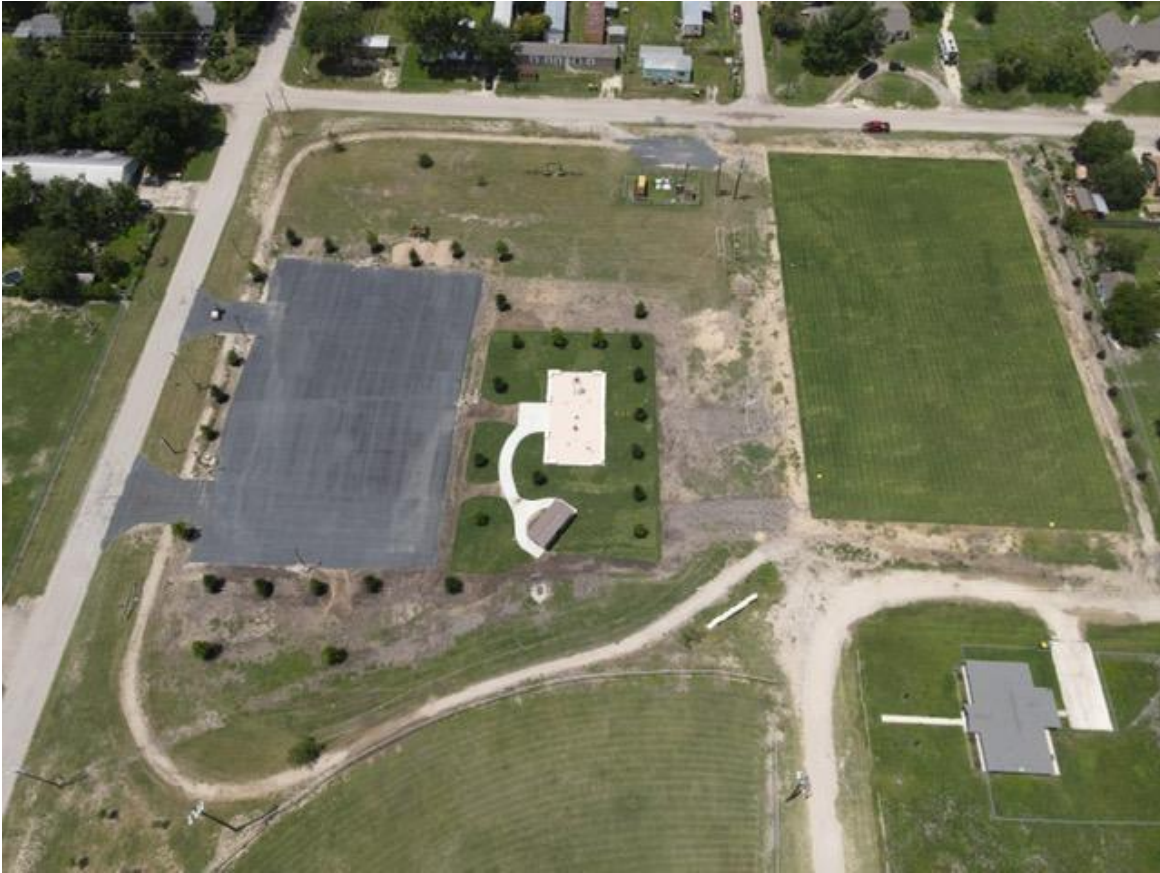
Lions Park in 2023 facing west with parking on the left, splashpad and bathroom in the center, and sports field on the right. (The softball field is partially shown.)