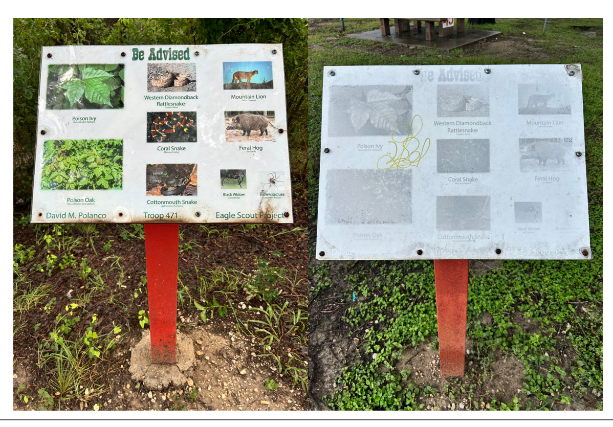
Comparison of "good" Be Advised Interpretive panel and one that is needing replacement.