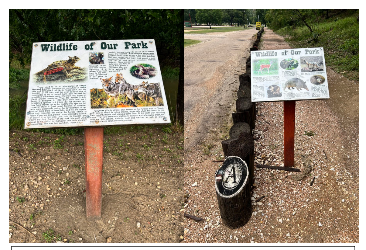
Installation of new Interpretive panels throughout Regional Park.