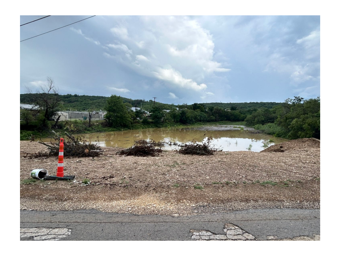
View of East pond after rain event on June 11-12, 2025.