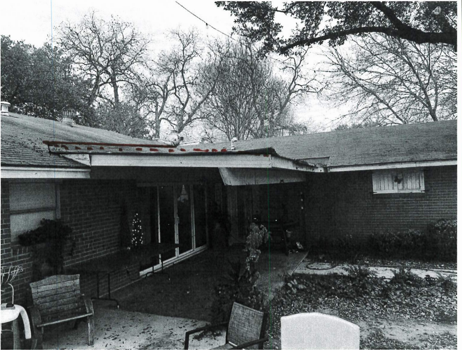
Back awning is rotting.