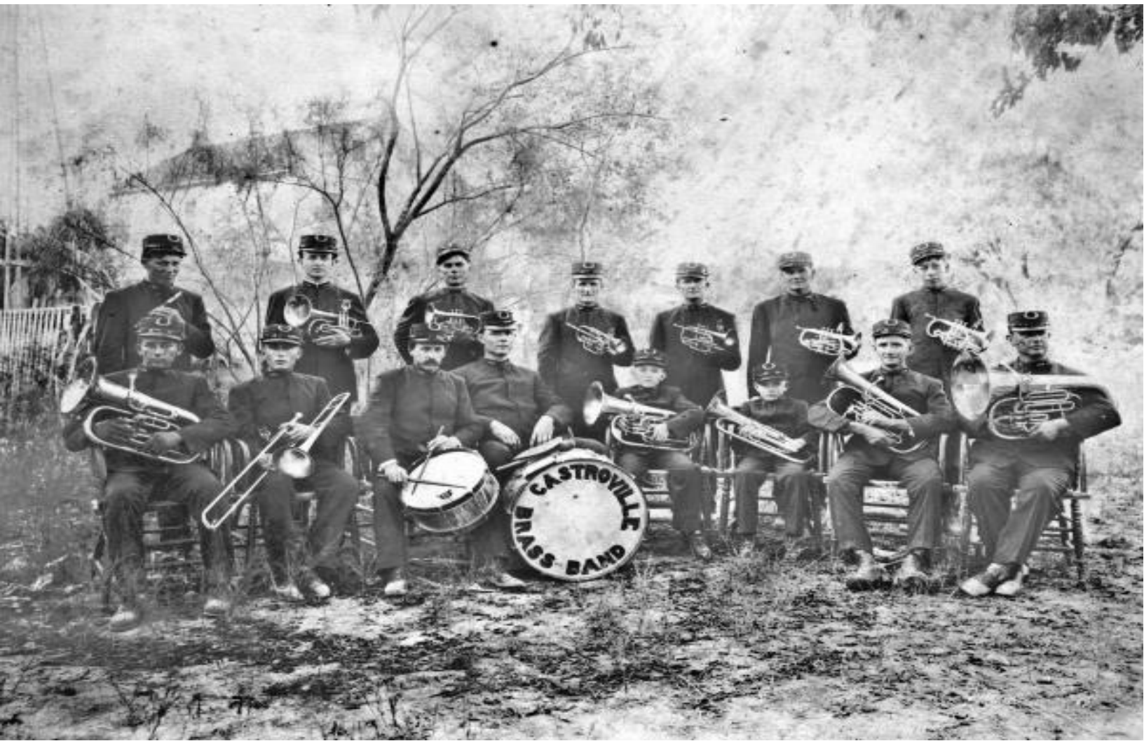
Castroville Brass Band, circa 1915. (MS 362: 081-0640)