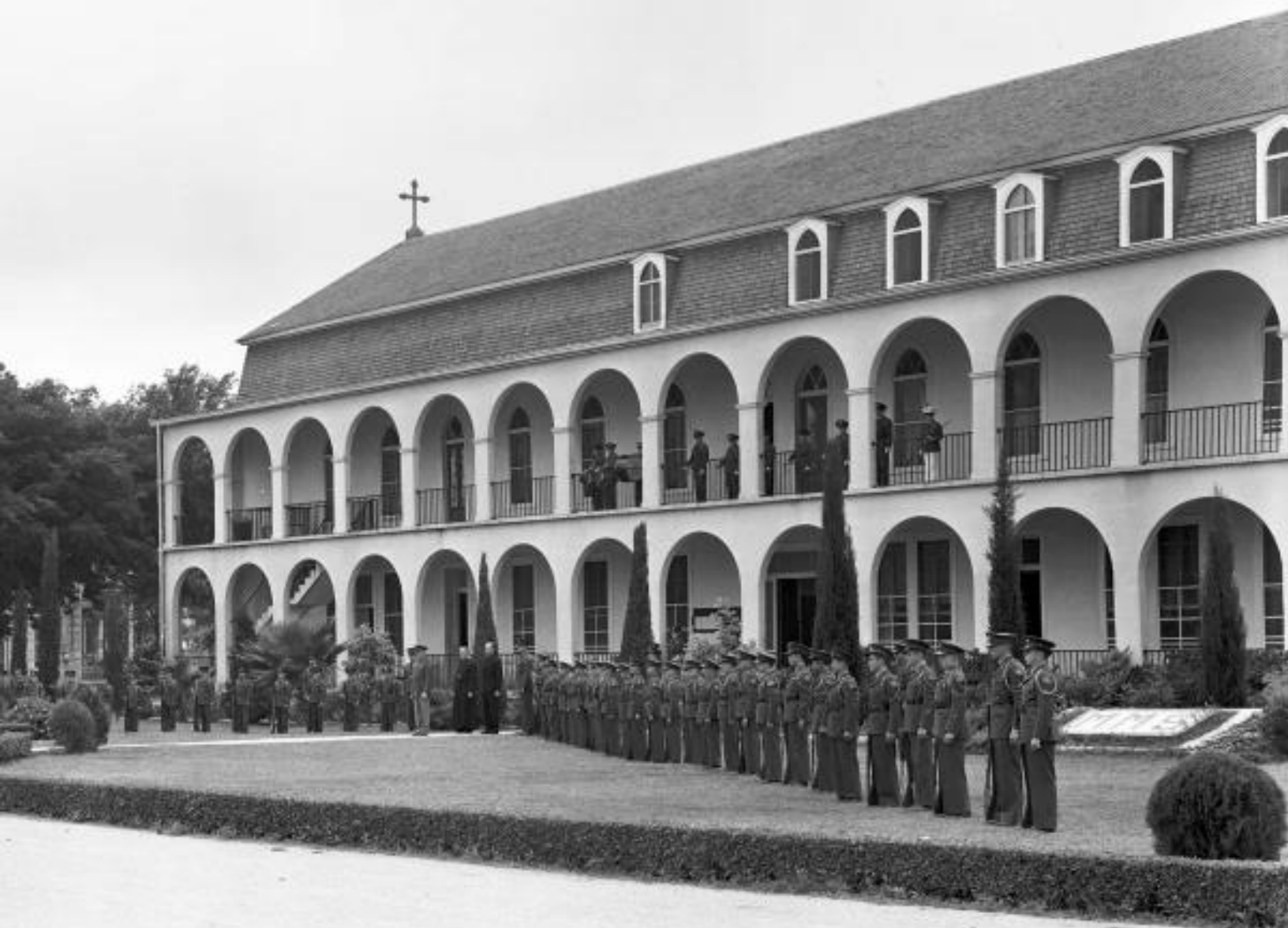
Moye Military School, London Street, early 1940s. (MS 355: Z-0310-A-2