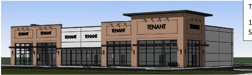
Town East Crossing

1726 Hwy 90 E, Next to Security State Bank