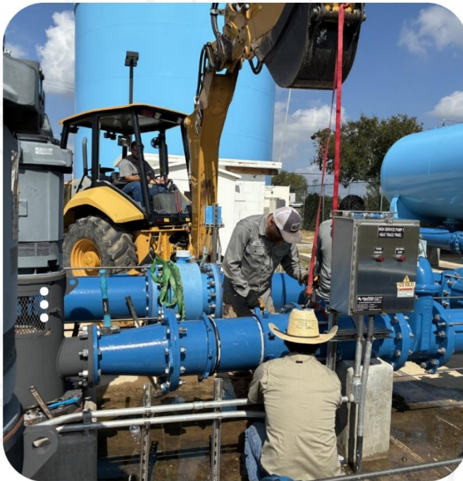
Water & Electric Crew Working on the MV Well