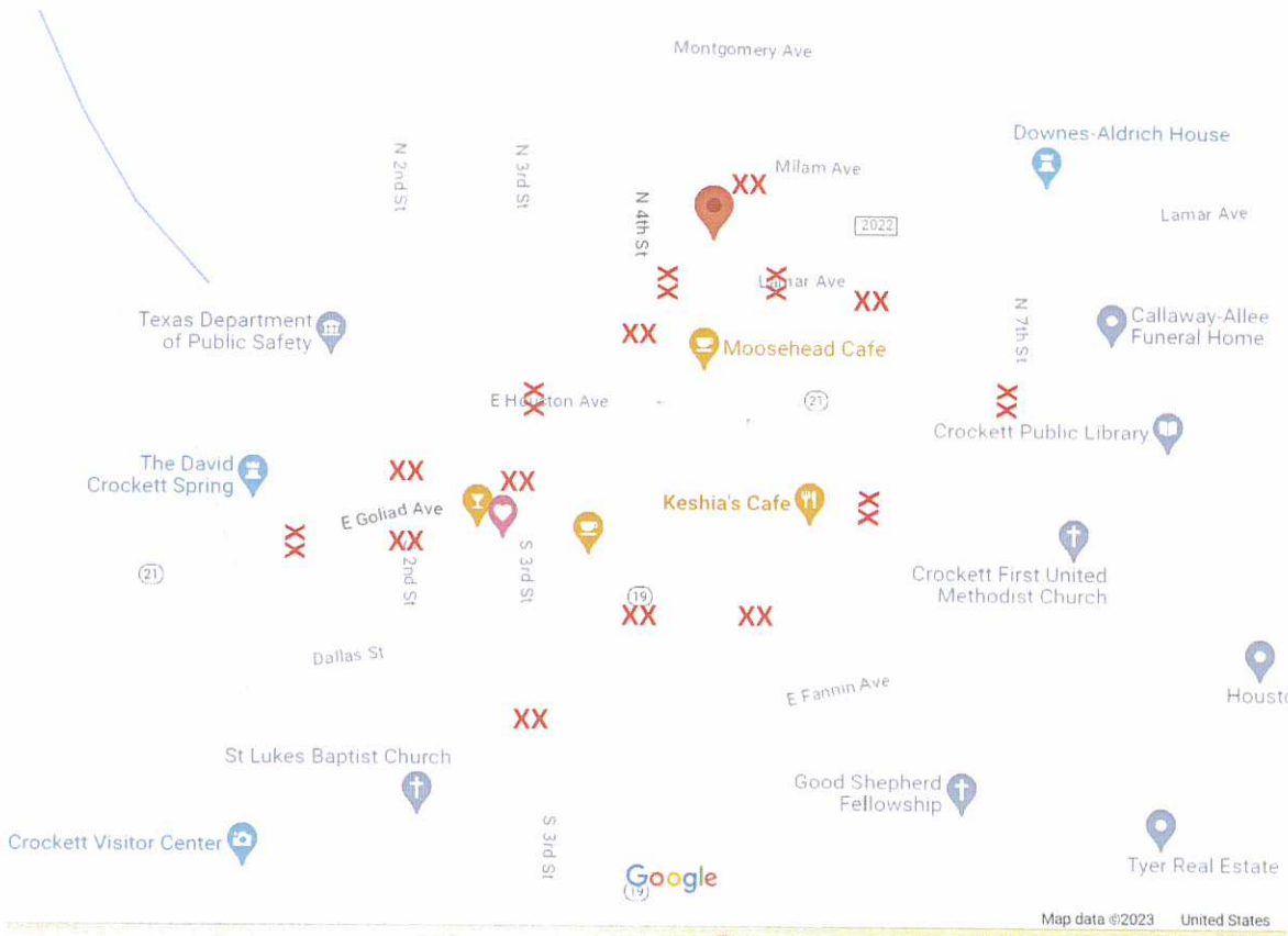
Map of street closures for Christmas in Crockett

Chamber safety director will use map to coordinate actions of various agencies (Crockett Police Department and the Houston County Sheriff's Department) to ensure maximum safety and traffic control during the event.