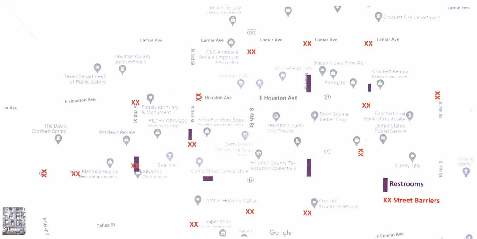
Map of street closures and restrooms for Christmas in Crockett

Chamber safety director will use map to coordinate actions of various agencies (Crockett Police Department and the Houston County Sheriff's Department) to ensure maximum safety and traffic control during the event.