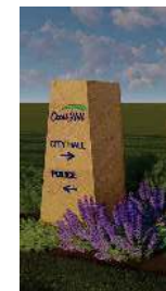
Identity Sign Illustration For Reference