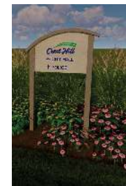
Wayfinding Sign Illustration For Reference