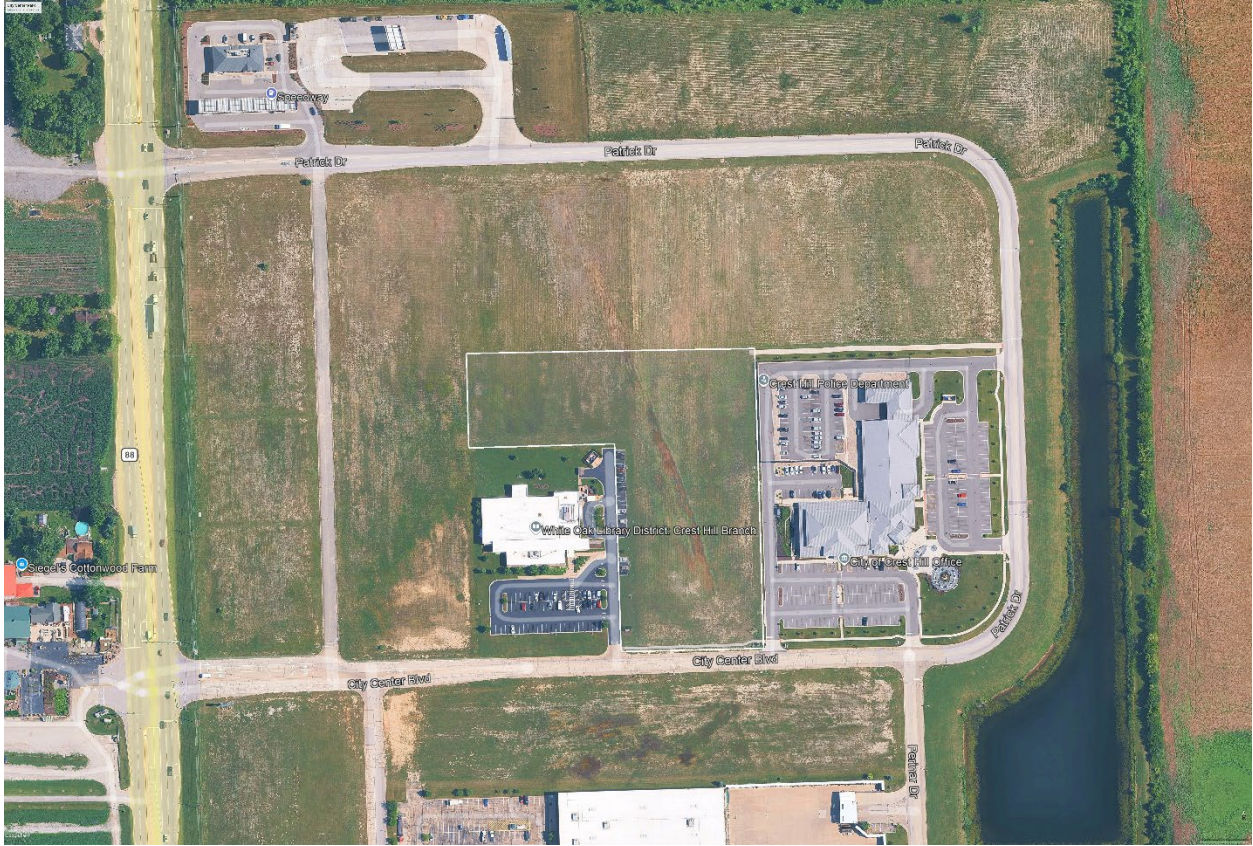
EXHIBIT A: LIMIT OF WORK