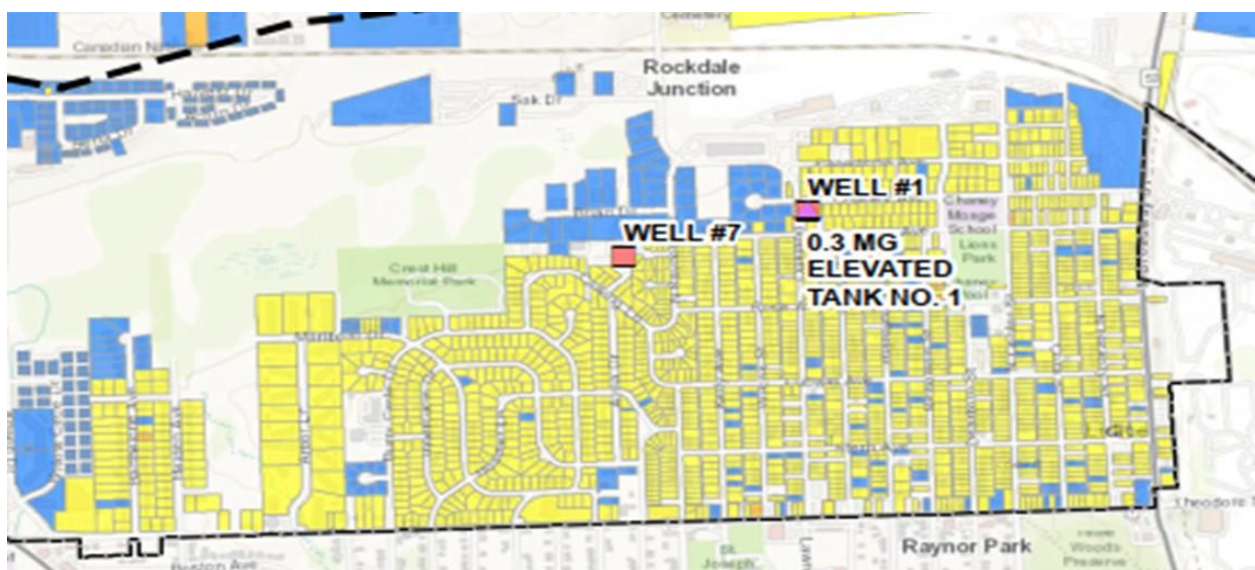
Figure 2. Southeast Area of System Where Confirmed CuLS Present