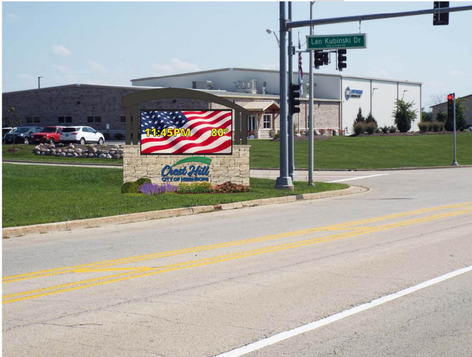
Caton Farm Rd. Eastbound