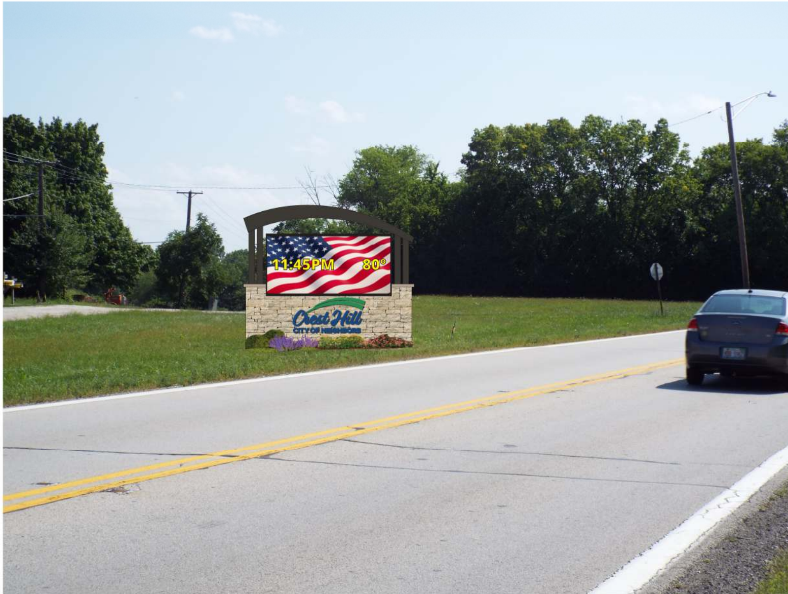
Renwick Rd. Eastbound