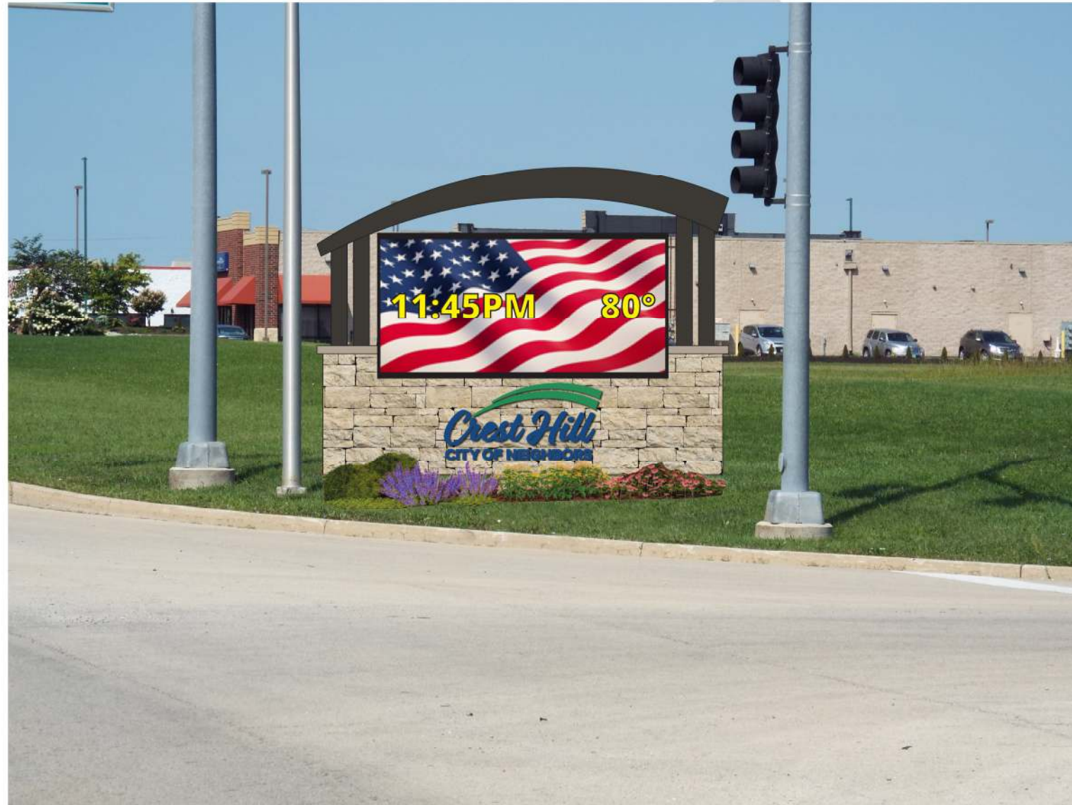
Caton Farm Rd. Westbound