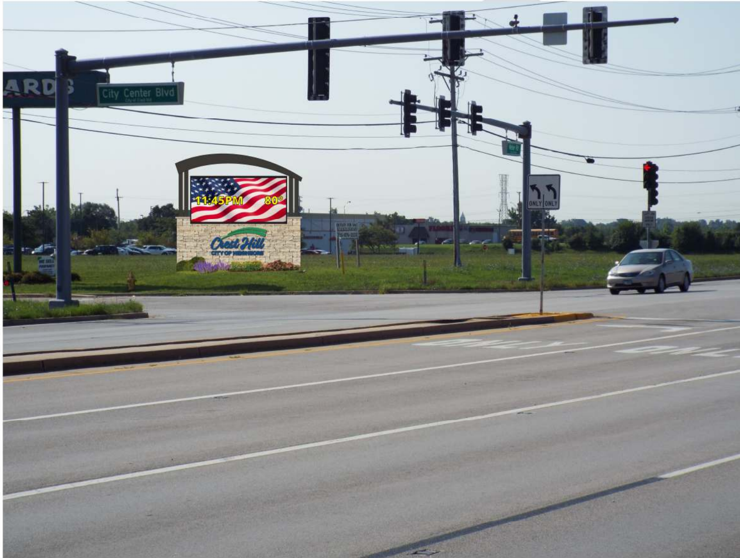
Weber Rd. Southbound