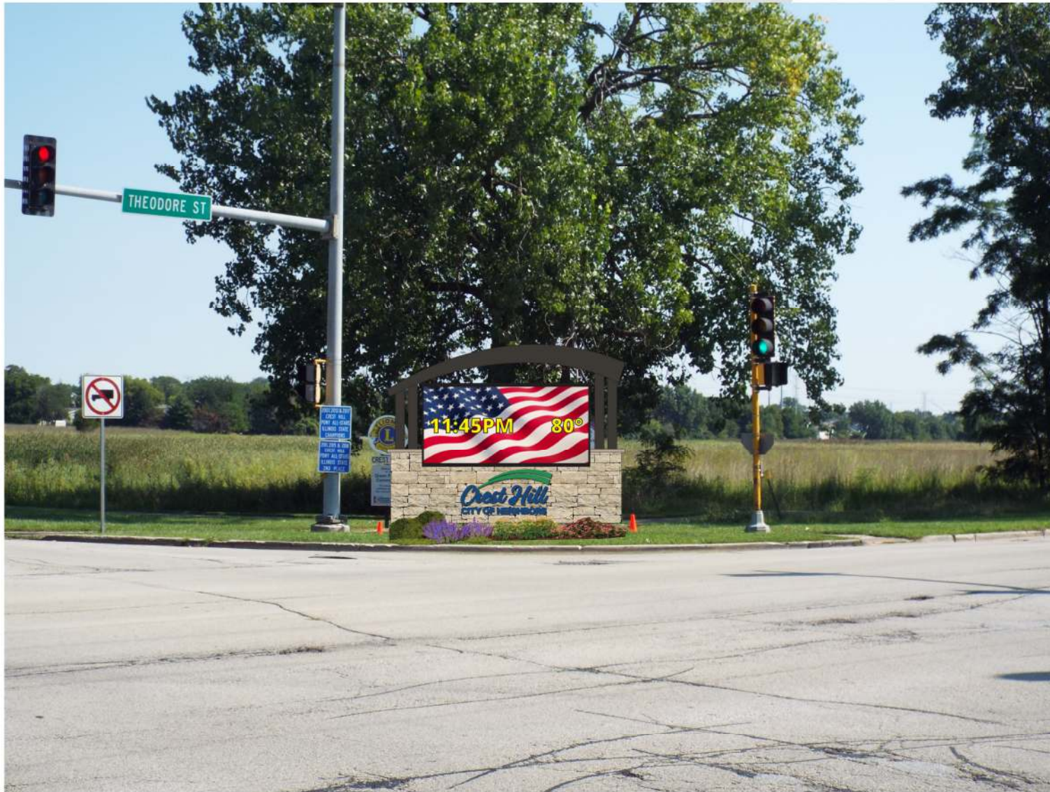
Theodore St & Gaylord Rd Site