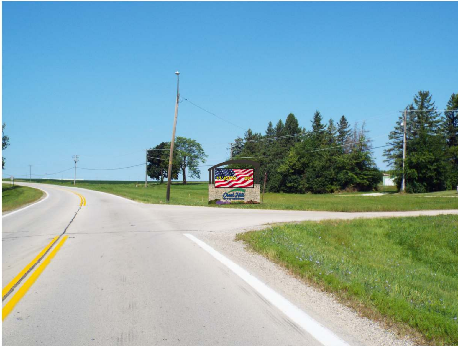
Renwick Rd. Westbound