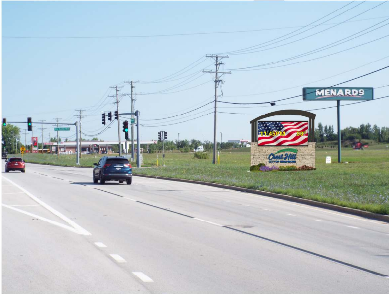
Weber Rd. Northbound