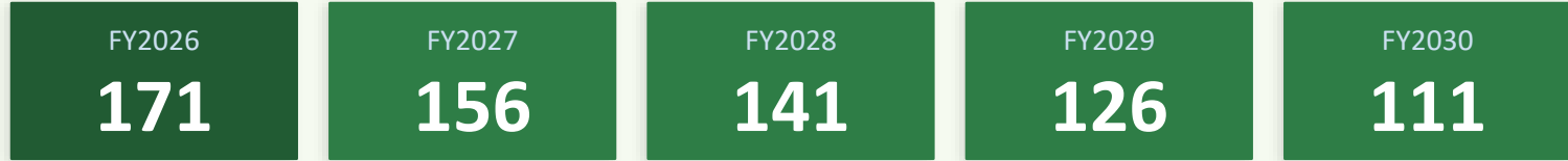
projected active devices at end of each fiscal year

Projected Device Fleet After Annual Replacements — Device Consolidation Impact