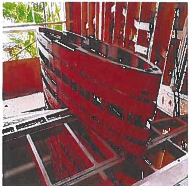
A solid stair structure to be clad in stone and wood for private residence in Hawaii. Case Study >>