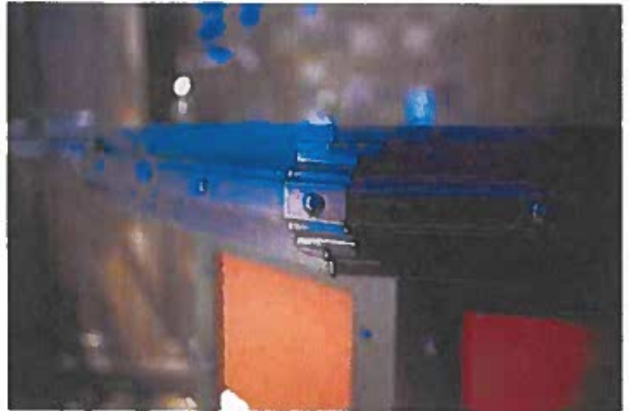
Steel bar counter.