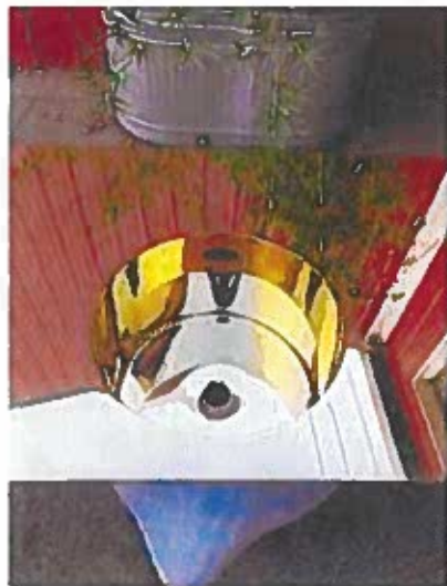
Brass counter with round sink.