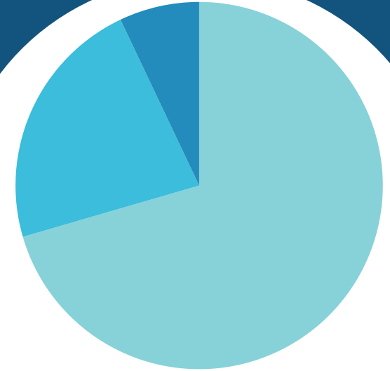
Measure B Actual Expenditures & Allocations